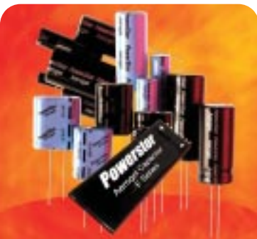
The PowerStor® aerogel supercapacitor

The investment by ATP in multiple energy storage research projects like MTI, Ovonic Battery, and PowerStor demonstrates the program's willingness to back more than one horse in a race and nurture multiple breakthrough technologies in the same category.