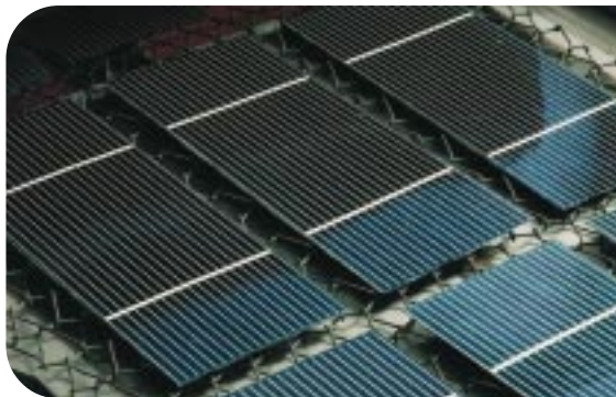
String Ribbon solar cells emerge from a processing furnace

Engelhard's Molecular Gate technology might not have gone forward due to lack of funding. It was considered too preliminary and too high risk despite its potential benefits. ATP support enabled the development of this promising technology, and provided the means for Engelhard to partner with universities possessing the special scientific and engineering expertise needed to bring Molecular Gate technology to fruition.