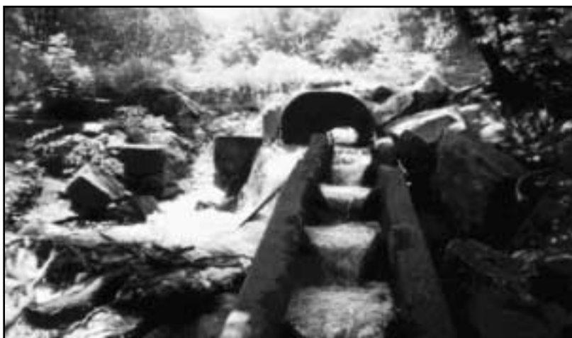
Pilgrim Trail Herring Restoration project in Plymouth, Massachusetts

The objective of this project is to restore the blueback herring and alewife run and their migratory habitat in Town Brook in Plymouth, Massachusetts. Town Brook, which empties into historic Plymouth Harbor just 100 yards from Plymouth Rock, is the location of the nation's first fish ladder. Town Brook has five major obstructions to fish passage. It currently supports a run of about 7,000 river herring that have been trapped and trucked upstream by the Massachusetts Division of Marine Fisheries and the Town of Plymouth.