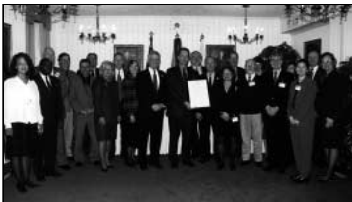
Principals Group 1999 fall meeting commitment ceremony

The Coastal America Principals Group met on June 16, 1999, and on December 8, 1999. In the spring meeting, the Principals discussed the advantages of Coastal America partnerships including stronger agency relationships, a broader understanding of agency programs, and better integration of those programs. At the fall meeting, the Principals signed a renewed commitment to the partnership. The Principals also approved the establishment of a National Corporate Wetlands Restoration Partnership (CWRP). The CWRP is a program designed to foster collaboration between the federal government, state agencies and private corporations. Private corporations that participate in this program will donate funds for either site-specific wetland or other aquatic habitat restoration projects or will provide matching funds to a national or regional effort in support of aquatic ecosystem restoration activities.