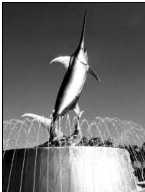
IGFA Fishing Hall of Fame and Museum, Florida

In 1999, Coastal America designated its tenth Coastal Ecosystem Learning Center and its first on the South Atlantic Coast. The International Game Fish Association (IGFA) Fishing Hall of Fame & Museum in Dania Beach, Florida was designated a Coastal Ecosystem Learning Center on November 16, 1999. The museum, which the IGFA opened in December 1998, provides information on sport fishing, fish and their aquatic habitats, and the need to conserve those habitats. The exhibits convey a strong message about the dependence of fish on their fragile aquatic environment, how humans impact that environment, and the need to conserve it.