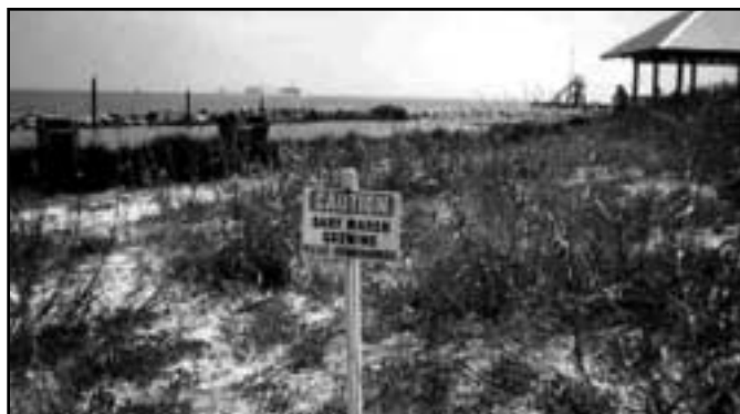
Dauphin Island dune and wetland restoration site, Alabama

This past year was also marked by efforts to recover from some of the damage done by Hurricane George. In Louisiana, Breton Island, a barrier island and segment of the Chandeleur Island chain, was restored with dredged material. Cat Island, at the mouth of Mobile Bay in Alabama, was denuded as the hurricane swept over this barrier island. The island is a designated Gulf Ecological Management Site because of its notable history as a nesting site for colonial birds. The fate of the colonial bird-nesting colonies that called the island home was jeopardized until the Dauphin Island Sea Lab championed and worked with several GMP and Coastal America partners to implement a recovery plan.