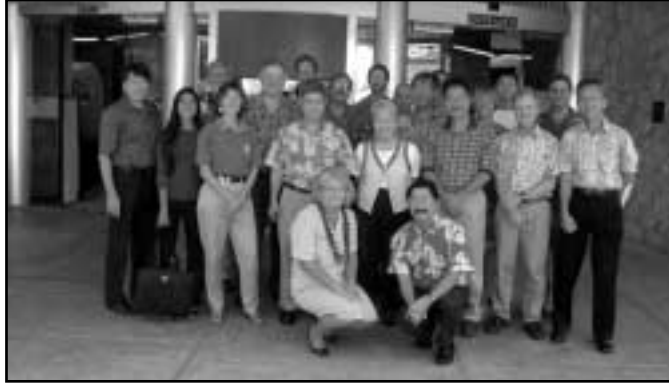
Pacific Island Regional Team Meeting

Invitation Letter to Pacific Islands Regional Implementation Team Meeting, September 1999