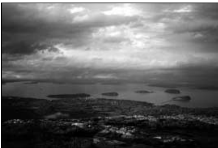
Bar Harbor coastline