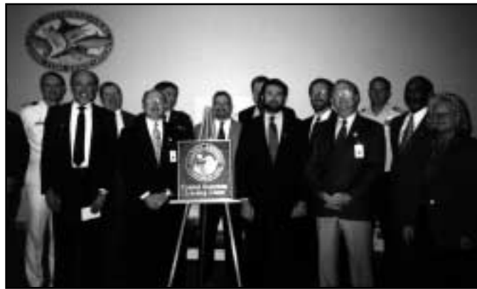
IGFA Fishing Hall of Fame and Museum Designation ceremony

Coastal America designated the International Game Fish Association's (IGFA) Fishing Hall of Fame and Museum as its 10 th Coastal Ecosystem Learning Center, on November 16, 1999. This was the first such designation for the SERIT and the first learning center along the south Atlantic coast. Each of the federal agencies on the SERIT made a commitment to the learning center as part of the designation ceremony. Commitments included provision of educational materials, confiscated fish and wildlife materials for exhibits, establishing a visiting scientist program and a day aboard the EPA's ocean survey vessel, the Peter W. Anderson , for education, outreach or research. Since the designation ceremony, SERIT members continued to work with the IGFA facility. For example, the National Oceanic and Atmospheric Administration's Coastal Services Center has provided substantial technical support for the IGFA learning center's web page.