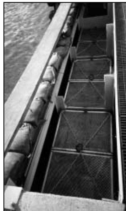
Lamprey eel traps

“This award acknowledges the real progress that can be made through “watershed partnerships,” in which the public, industry, state, federal, local and tribal governments work together to improve the recovery of one of Alaska’s most precious resources – water.”