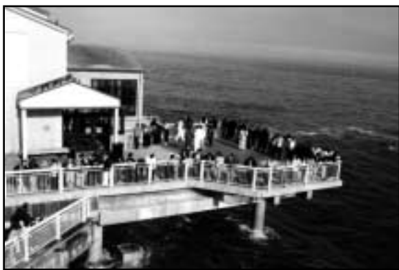
Monterey Bay Aquarium