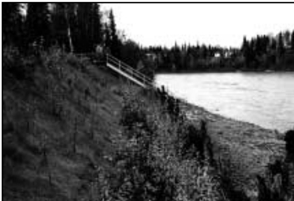
Kenai River restoration site, Alaska

Located 75 miles south of Anchorage, Alaska, on the Kenai Peninsula, the Kenai River drains more than 2,000 square miles of diverse landscape. The river is the state's premier chinook salmon and trout stream, and provides important rearing and spawning habitat for other valuable fish species. The area is experiencing rapid development and increased pressure from recreational groups resulting in the loss of high-value aquatic and wetland habitat. The banks of the Kenai and other south-central Alaska streams were degraded by boat wakes and foot traffic of fishermen. Important rearing habitat for juvenile salmonids was also lost, and development has led to the filling of adjacent wetlands and the bulkheading of shorelines.