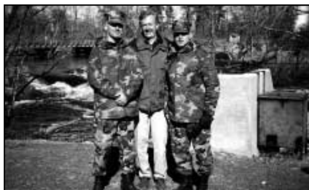
Secretary Babbitt with members of U.S. Marine Corps after initial breach of Rains Mill Dam, North Carolina

A dedication ceremony was held on December 1, 1999, to celebrate commencement of the project. Participants included the Secretary of Interior, Assistant Secretary of the Navy (Installations and Environment), Secretary of the North Carolina Department of Environment and Natural Resources, other federal and state officials, media representatives, and members of the public.