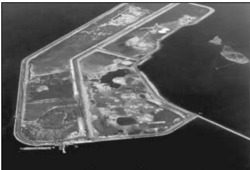
Poplar Island, Maryland

The MARIT has continued to work with residents of Tangier Island, Virginia to help implement their Tangier Stewardship 2020 Initiative. Currently, a USACE request for cost-share commitment is garnering local support for project development. NOAA, USACE, and USFWS are working with this fishing community to identify priority sites for wetland and seagrass restoration and protection. The MARIT hopes to link a new project at Tangier Island with existing USACE projects on Smith Island, MD, and at Saxis, VA, both areas of habitat loss.