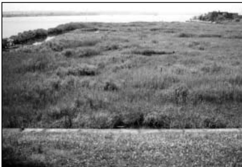
Ft. McHenry Wetlands Restoration site, Maryland

The National Aquarium in Baltimore brought together a team of 4 federal agencies (NOAA, EPA, NPS, USGS) and several Maryland state agencies, local government agencies and non-governmental organizations to restore and maintain a 10-acre tidal wetland adjacent to the Fort McHenry National Park. This project enhances education and outreach efforts by involving citizen volunteers in restoration activities as well as establishing a long-term water quality monitoring station to deliver real-time data to various agencies and the public.