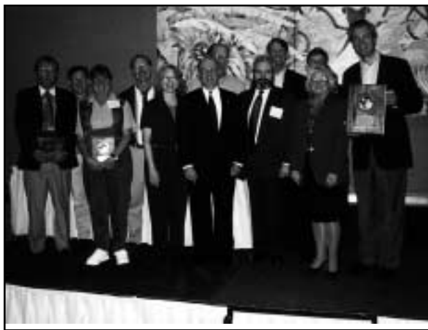
Shamrock Island Protection and Restoration Team

placement of a geotube breakwater. Virtually every aspect of this project—from the concept and design to permitting, construction, and even financing—was the result of innovative partnerships and cooperative efforts. Public interest in the fate of the island and in the success of the project was very high. To make things more challenging, the work had to be completed during the winter to avoid disturbing the birds during their spring nesting season. Daily oversight by team members resulted in the project being completed in record time and under budget.