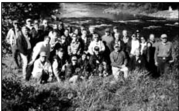
Coastal America Team on field trip in the Penobscot Watershed, Maine

The National Implementation Team met monthly to address national policy issues and held its annual retreat with the Regional Implementation Team members September 22-24, 1999, in Bar Harbor, Maine. National and regional team members gathered to share ideas, discuss new concepts for improving the interagency partnership process, and identify opportunities for future collaboration. There were presentations and discussion on education/outreach issues, Coastal Ecosystem Learning Centers, technology transfer, regional support, and Coastal America's Strategic Plan.