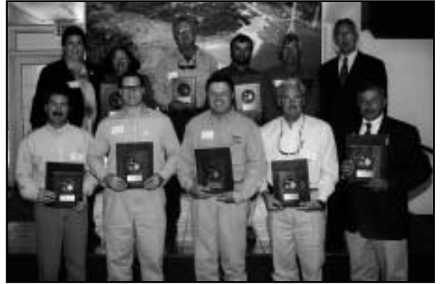
Clear Creek Restoration Team

Coastal America presented a Partnership Award to the Clear Creek Wetland Restoration Team for their cooperative effort to plan, coordinate, and evaluate projects in the Clear Creek Watershed. The Clear Creek watershed in Galveston Bay, Texas experienced substantial wetland loss due to subsidence from groundwater withdrawal and erosion caused by extensive recreational boating. This team restored 15 acres of wetlands habitat using dredged material from cooling water intake channels and an innovative cordgrass planting method. Follow up monitoring confirms that the plant materials are well established and the site continues to provide habitat for a rich diversity of fish, shellfish and birds – including several endangered species such as bald eagles.