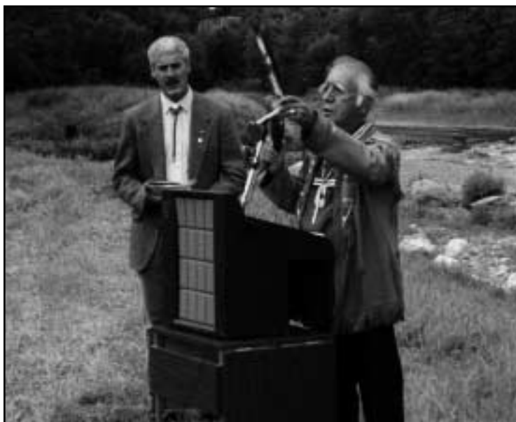
Blessing of restored Souadabscook Stream by a Penobscot Indian Tribal Elder

Members of the Penobscot Watershed Anadromous Fish Restoration Team received a Partnership Award from Coastal America to recognize the team's efforts in removing three dams on the Souadabscook Stream in the Penobscot Watershed in Maine. The dams blocked the upstream passage of native anadromous fish for over 250 years. The largest of these dams, the Grist Mill Dam, was at the head-of-tide and was the most significant barrier to migrating fish. The two other dams were located upstream. When the partners were successful in removing these impoundments, water aeration increased and stream temperatures were reduced, which improved conditions for forage fish like the American shad, alewives and rainbow smelt, and important game fish like the Atlantic salmon, sea run brook trout and striped bass. It has also eliminated the potential of localized flooding and the expensive damage to Route 1A from erosion and piping. In addition, the "canoe-ability" and kayak use of the stream has been improved, along with the general aesthetics of a stream restored to its natural condition.