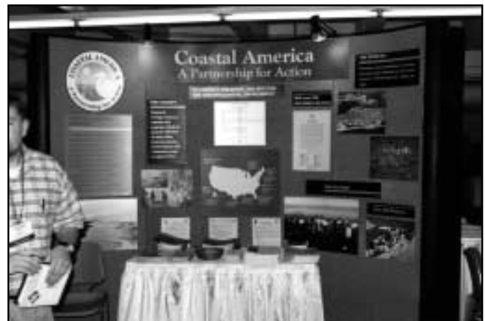
Coastal America exhibit at the CZ99 conference