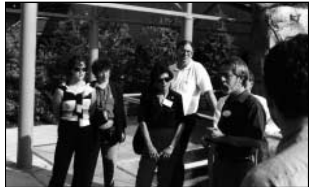
Meeting participants touring exhibits at the Mystic Aquarium

The Mystic Aquarium hosted the regional meeting for the Northeast and Mid-Atlantic learning centers and Regional Implementation Teams. Presentations were given by each of the learning centers and the federal agency representatives. Participants shared success stories and lessons learned from previous efforts to collaborate and discussed opportunities for future collaborations. Participants brainstormed in breakout sessions on strategies for increasing public awareness of the importance of coastal and ocean resources, and identified project priorities for the coastal ecosystem learning center network.