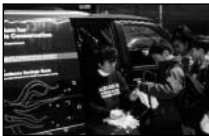
New York Aquarium Education Program

NAIB also conducted extensive seagrass restoration projects at: Langley AFB, VA; Naval Academy, Ft. Eustis, VA; and Naval Amphibious Base, Little Creek, VA. This work was part of a joint project with the Alliance for the Chesapeake Bay that included transplanting over 10,000 planting units, preparation of a scripted slide show, and transmission of digital images for use on the Department of Defense website.