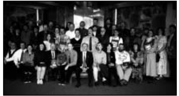
Duck Creek Advisory Group

The Duck Creek Advisory Group (DCAG) was presented with a Coastal America Partnership Award for implementing plans and projects to restore spawning and rearing habitats of anadromous fish in Duck Creek, Alaska. The creek's anadromous fish population suffered greatly due to physical habitat alteration, poor water quality, loss of riparian vegetation, and loss of estuarine wetlands as a result of urbanization. Increased urbanization also resulted in water diversion, sedimentation of pools and riffles, channelization, inadequate stream crossings, loss of riparian habitat, and littering. Various projects were completed to improve water quality and to restore spawning and rearing habitat of the anadromous fish population. Several culverts were replaced with bottomless arches or bridges to improve fish passage. An important spawning reach was cleared of sediment and the channel was reconfigured to increase velocity and dissolved oxygen; several riparian areas have been re-vegetated to control erosion and provide cover; and two freshwater marshes were created to improve water quality and provide salmonid overwintering habitat.