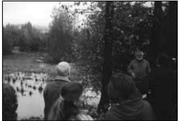
Restored wetland in Duck Creek Watershed, Alaska

In 1999, the Alaska Regional Team (AKRIT) continued to extend the partnership by working on the restoration of anadromous and riparian areas, such as Duck Creek, winner of a 1999 Coastal America Partnership Award, and Chester Creek. The intent of the Chester Creek restoration project is to improve the quality of fish and wildlife resources by replacing the existing culvert and fish ladder system located at the outlet from Westchester Lagoon to Knik Arm with a new structure. In addition to contributing to the restoration of native salmon runs, the project would restore part of the creek to an open channel, return tidal fluctuation to existing wetlands, enhance waterbird habitat, increase recreational opportunities at the creek's mouth, and provide opportunities for education and outreach. The team also explored further partnership opportunities with the State of Alaska and began testing new technologies such as the Submerged Aquatic Vegetation Early Warning System (SAVEWS). The SAVEWS was developed by the U.S. Army Engineering Research and Development Center and has been used in other Coastal America collaborations to map several types of vegetation in coastal areas of New England and Oregon. This technology was also used to map eel grass beds in Southwest Alaska. However, the SAVEWS had not been tested on key vegetation types or conditions unique to Alaska waters.