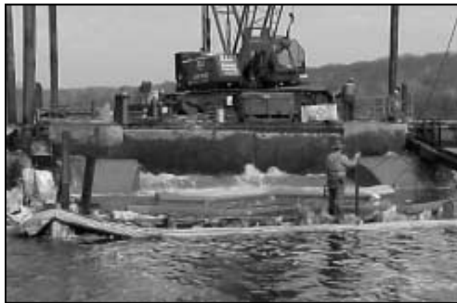
Construction of Little Falls Dam Fishway, Maryland

The big event for the Mid-Atlantic Regional Implementation Team (MARIT) in 1999 was the construction of the Little Falls Fish Ladder at the Little Falls Dam located on the Potomac River one mile upstream of the District of Columbia and Maryland borders. A ceremonial dam breaking was held October 12, 1999, at the Washington Aqueduct Little Falls Pumping Station. U.S. Senator Paul Sarbanes and Congresswoman Constance Morella of Maryland, Interior Secretary Bruce Babbitt, Maryland Governor Parris Glendening and approximately 125 federal, state and local dignitaries attended. The fish ladder project was coordinated by the Little Falls Task Group of the Fish Passage Workgroup of the Chesapeake Bay Program. The project was completed in January 2000 to meet the shad migration which starts mid-spring. The Little Falls project has a web site located at http://www.chesapeakebay.net/info/littlefall.html .