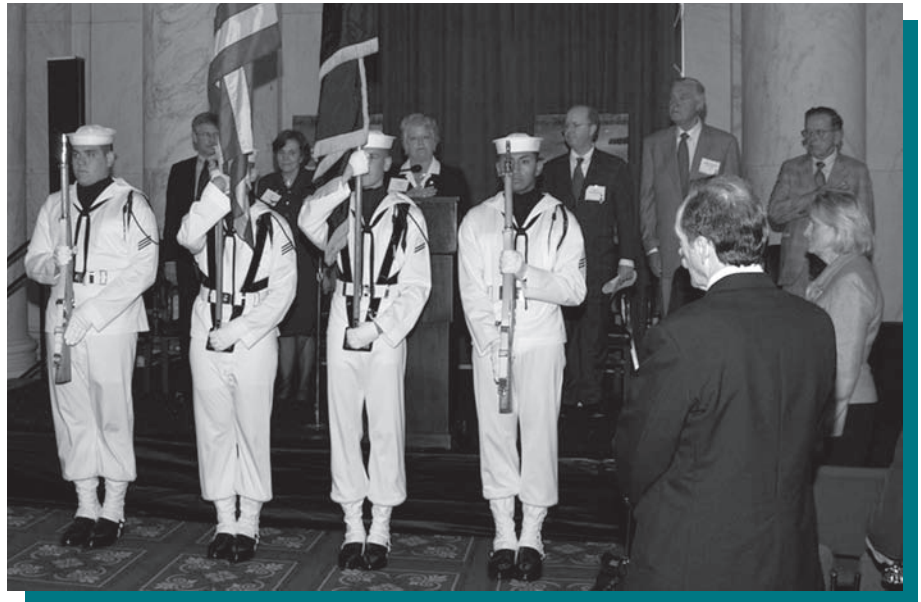
The Navy Color Guard provided ceremonial honors at Coastal America's Celebration.