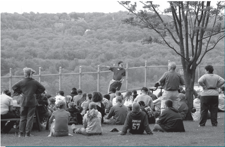
Students from Dubuque, Iowa and their neighboring states learn how activities of the Mississippi River watershed affect the ocean.