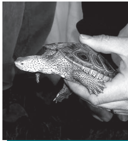
DE CWRP sponsored a project to restore nesting habitat for the Northern Diamond-backed Terrapin.

The DE CWRP sponsored their first project, the Old Islet Terrapin Habitat Enhancement Project, on May 6th. The project goal is to restore nesting habitat for the Northern Diamond-backed Terrapin and develop a habitat enhancement effort compendium for assisting other species in the future. Members of the DE CWRP, including Conectiv Energy, AstraZeneca, Premcor, ERM Consulting, and HTW Consulting, participated in the event. They were joined by Secretary of the Delaware Department of Natural Resources and Environmental Control and members of the Divisions of Fish & Wildlife, Soil & Water Conservation and Parks & Recreation.