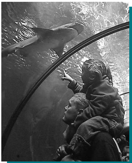
The Oregon Coast Aquarium (Co-Designated with Hatfield Marine Science Center—see page 6)