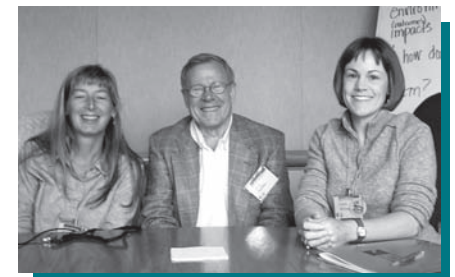
Coastal America Learning Centers joined NOAA and others to discuss Free-Choice Learning and ocean literacy.