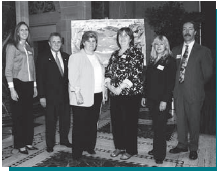
Coastal America is among noted partners at the NOAA Fish Poster Ceremony.