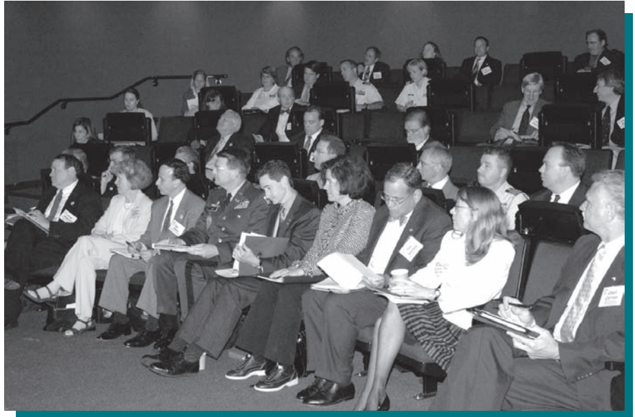
Mid-Atlantic and Northeast Coastal America Principals discuss collaborative partnering in Boston.