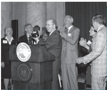
Jim Connaughton, CEQ, presented Admiral Watkins with the Senator John H. Chafee Coastal Stewardship Award.

Leaders from Congress, President Bush's Administration, federal agencies, local and state governments, and environmental organizations came together on June 6th, at the Senate Caucus Room to honor Admiral James D. Watkins, USN (Ret.), for his leadership of the U.S. Commission on Ocean Policy. Senator Ted Stevens (R-AK) participated in the award ceremony stating, "The U.S. Commission on Ocean Policy, under the leadership of Admiral Watkins, has provided our