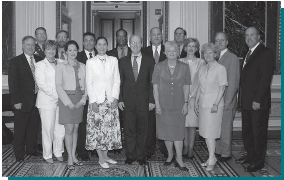
National and Regional Principals discuss collaborative partnerships at the White House Executive Office Building.