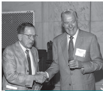
Senator Stevens (L) offers congratulations to Admiral Watkins (R) on receiving the prestigious Coastal Stewardship Award.

Nation with a blueprint for managing our oceans and coasts for the next century.”