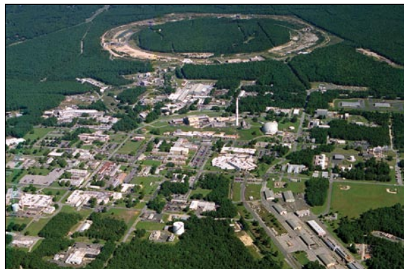
An aerial view of Brookhaven Lab

More than 30,000 people visit Brookhaven Lab each year. For information on tours, the science museum, and educational and outreach programs, call (631) 344-2345.