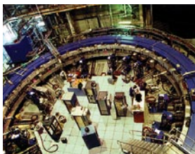
An experiment at the AGS, site of three Nobel Prize-winning experiments.

explains how ion channels generate nerve impulses in the human body.