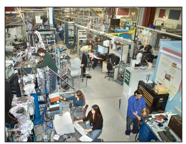
Users at a beamline on the floor of the National Synchrotron Light Source

Scanning Transmission Electron Microscope. www.bnl.gov/ bnlweb/facilities/STEM.asp