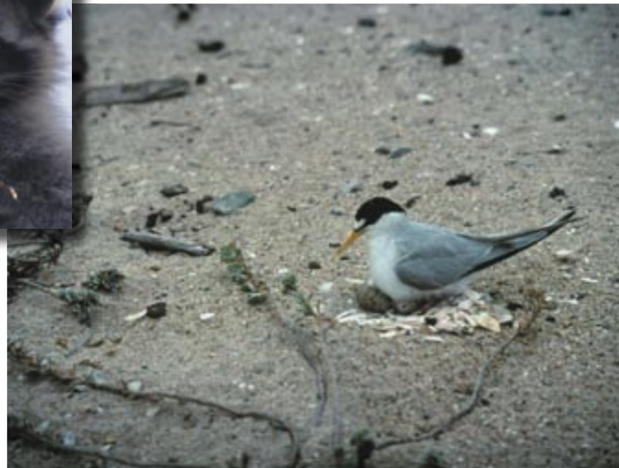
NWRC scientists are studying alternative methods for reducing wildlife predation on endangered and threatened species, such as the California least tern.