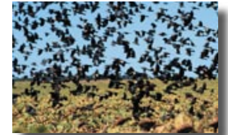
Blackbirds annually damage $5 million to $8 million worth of ripening sunflower in the northern Great Plains.

The Center relies on the services of people with additional specialties through extensive cooperative ties with universities, not-for-profit research facilities, and other public and private research entities. NWRC has achieved an integrated, multidisciplinary research agenda that is uniquely suited to provide scientific information and solutions to wildlife damage problems.