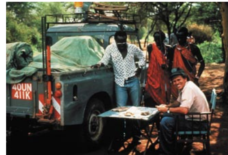
The Center's international activities develop working relationships with people around the world.

agricultural damage caused by a variety of rodents, birds, and other vertebrate pests in Latin America, Africa, and Asia.