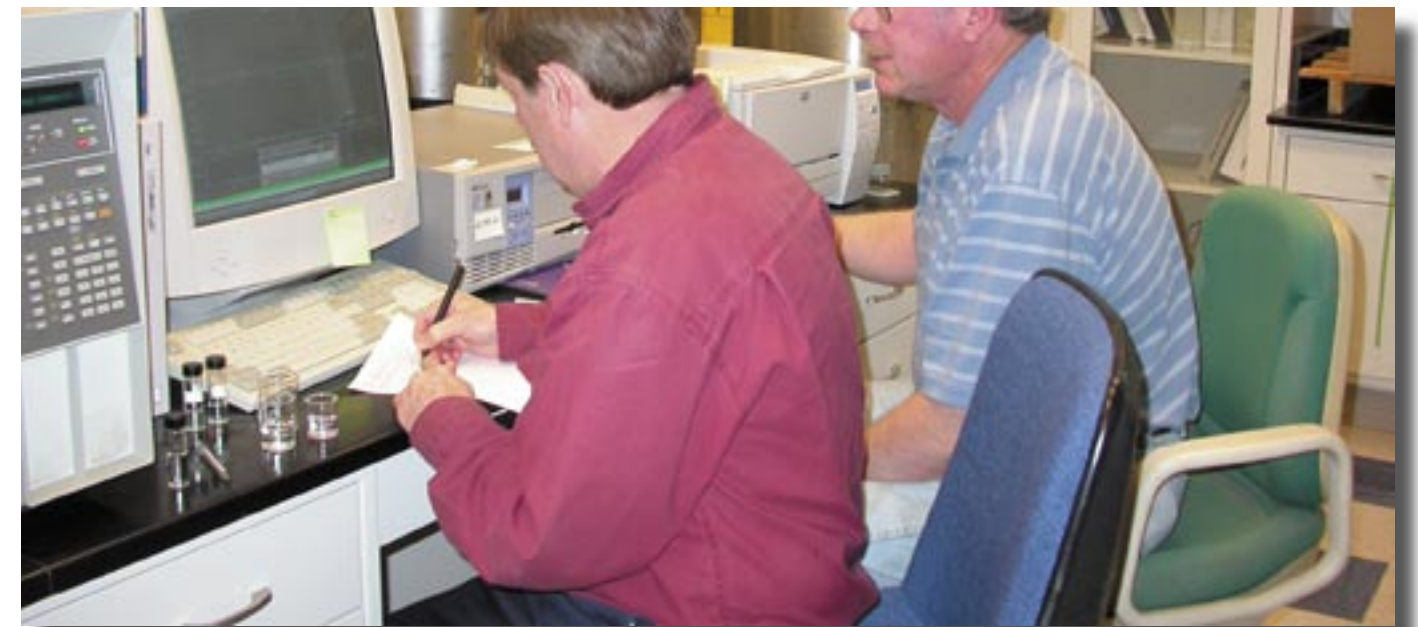
NWRC scientists use many modern methods in their attempts to resolve conflicts between people and wildlife.