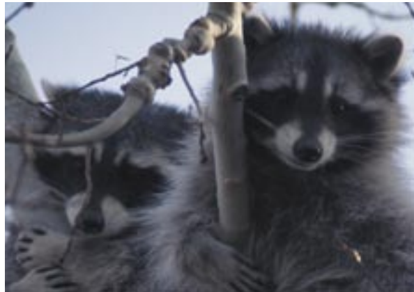
Wildlife rabies poses significant risks to humans, their livestock and pets, and to wildlife.

New York Bureau of Wildlife Texas Sheep and Goat Raisers Association USDA Forest Service U.S. Department of Defense U.S. Federal Aviation Administration U.S. Fish and Wildlife Service U.S. Geological Survey Washington Forest Protection Association Wisconsin Department of Natural Resources