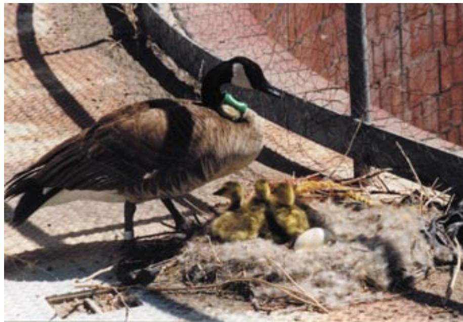
Research on reproductive control of overabundant animal populations, particularly those inhabiting urban or suburban settings such as Canada geese and deer, is a high priority within the WS program.

and materials for reducing damage caused by animals. Through the publication of results and the exchange of technical information, the Center provides valuable data and expertise to the public and the scientific community, as well as to APHIS' WS program.