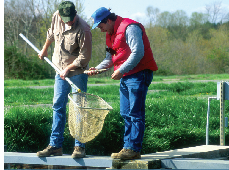
Evaluating cormorant damage at fish farms.

Once benefits are identified, a monetary value must be assigned. This is the most difficult and sophisticated part of the BCA and is where economists play an important role. Some resources that are bought and sold regularly (e.g., market goods such as cattle or corn) are easily assigned a value. It’s more difficult to determine the value of a wild antelope or an endangered Puerto Rican parrot, a decrease in the spread of a disease, or enhanced wildlife viewing opportunities. When markets do not exist, valuation must be estimated using nonmarket techniques.