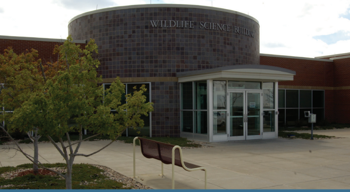
NWRC headquarters in Fort Collins, CO.