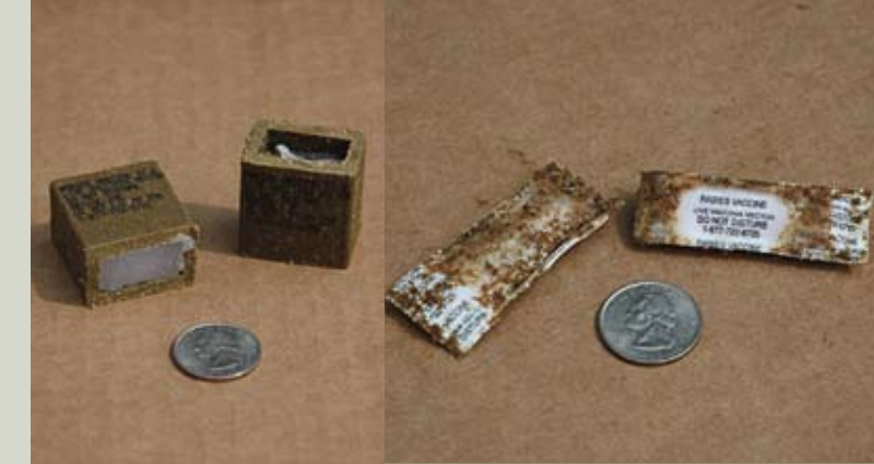
Fishmeal-polymer bait (left) and a coated sachet (right).