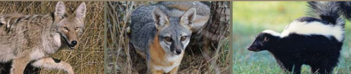
Pictured are some of the species that commonly carry rabies—coyote, fox, and skunk.

WS established its National Rabies Management Program in recognition of the changing scope of rabies. The program aims to prevent the further spread of rabies by containing the raccoon variant and, eventually, to eliminate terrestrial rabies in the United States through an integrated program involving the use of oral rabies vaccination (ORV) of wildlife.