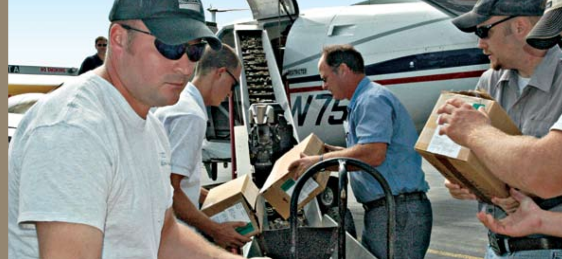
Aerial drops of ORV baits are the most cost-effective way to distribute vaccine in rural areas. Here, WS employees load baits onto a fixed-wing aircraft.