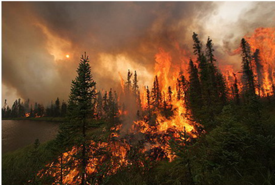
Figure 3. Major wild fires have impacted large parts of northern Alaska during the last two summers.