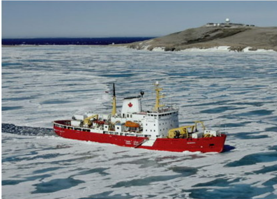
Figure 2. While less sea ice may open the Arctic in general to increased shipping, important passes and straits could be clogged with wind-blown ice in some years, increasing hazards to shipping (Canadian Ice Service).