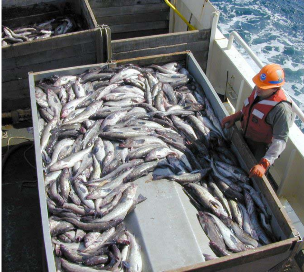
Figure 4 The pollock fishery in Alaskan waters has been favored in the last decade due to less sea ice and warmer ocean temperatures.