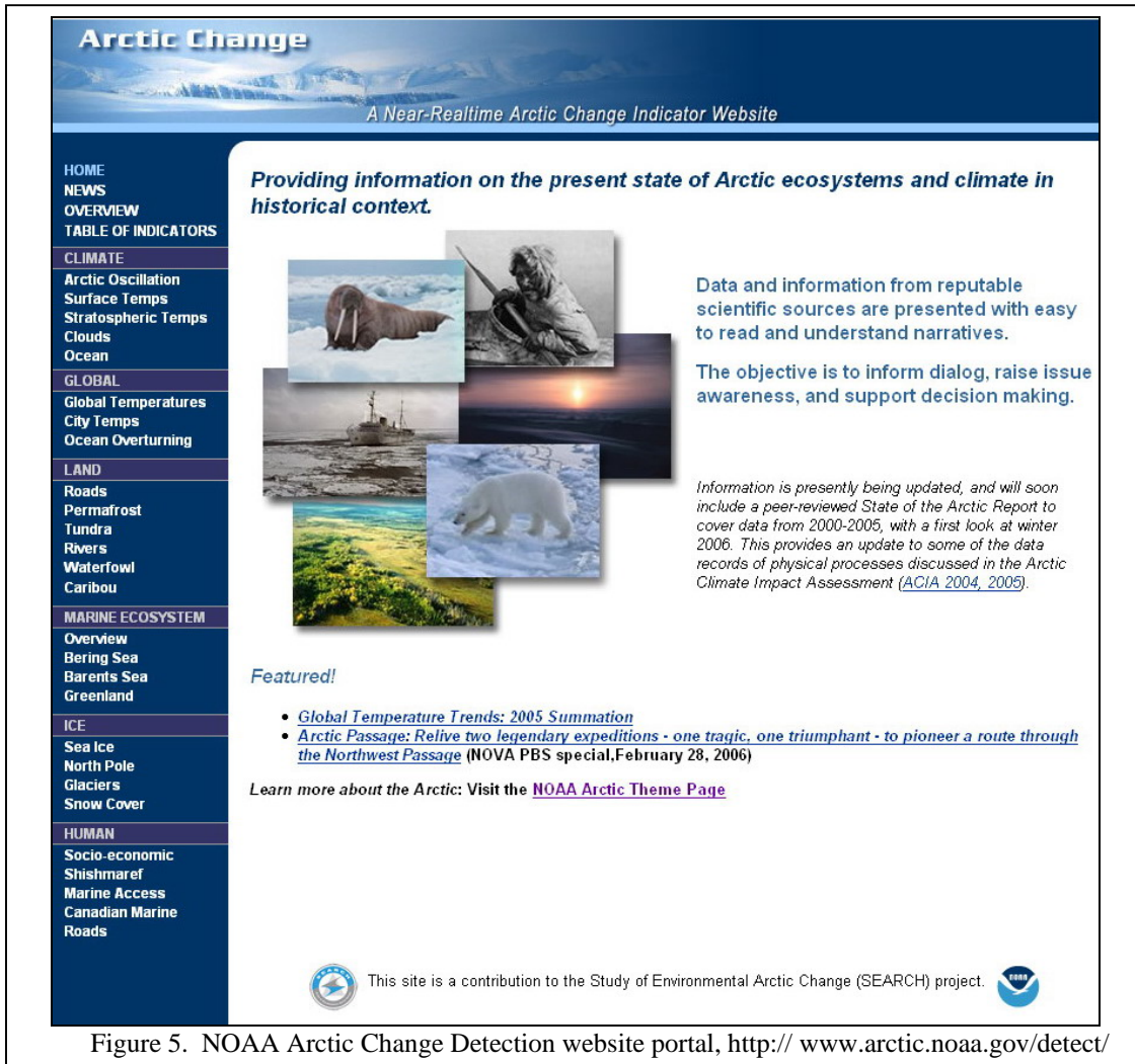
Figure 5. NOAA Arctic Change Detection website portal, http:// www.arctic.noaa.gov/detect/

Major communication/education accomplishments include: