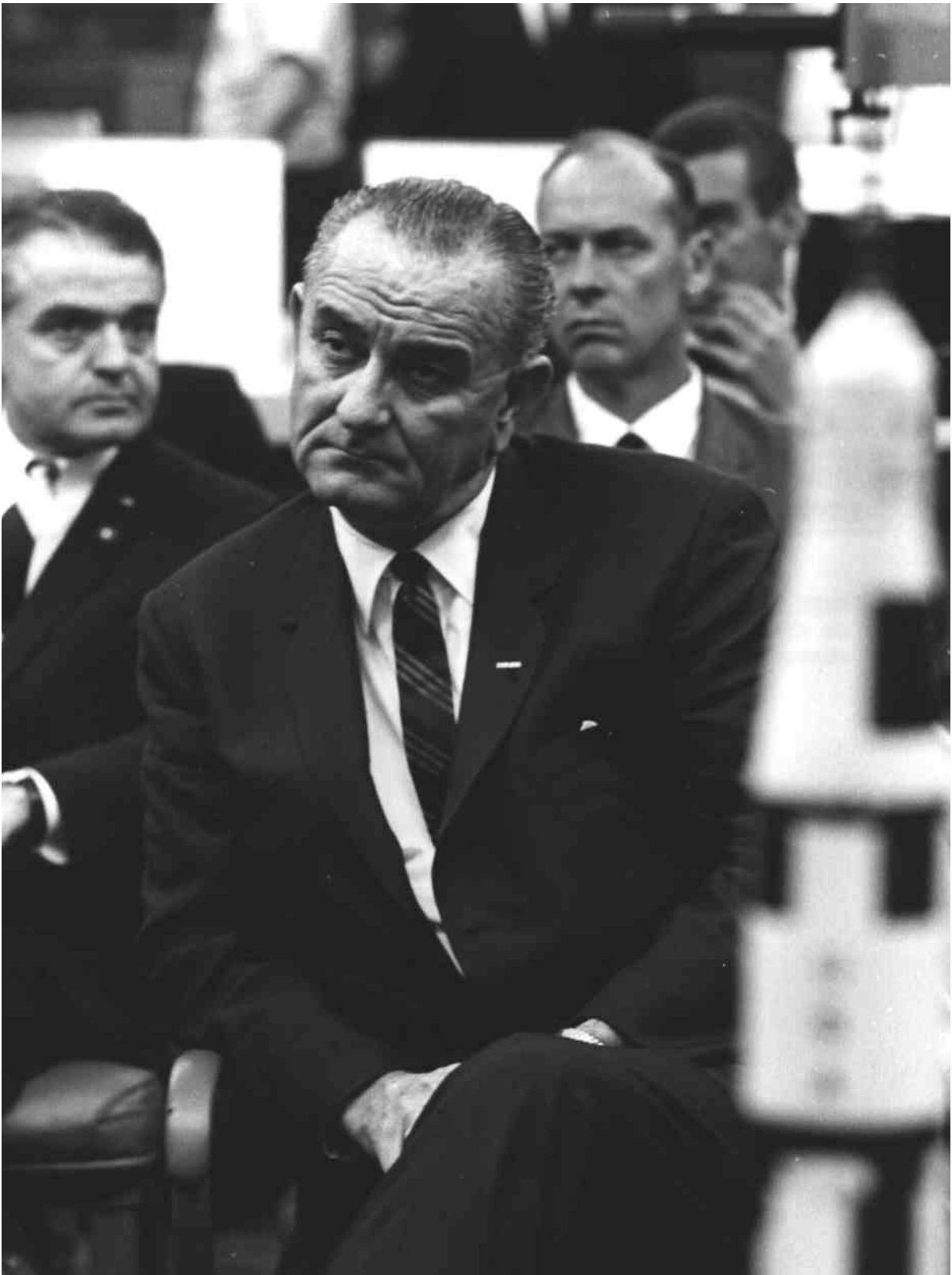
No one understood the importance of the launch of Sputnik for the psyche of the American people more effectively than Senate Majority Leader Lyndon B. Johnson. Here he is shown as president on September 15, 1964, at a meeting hosted by NASA, the agency that he helped to create with the National Aeronautics and Space Act of 1958.