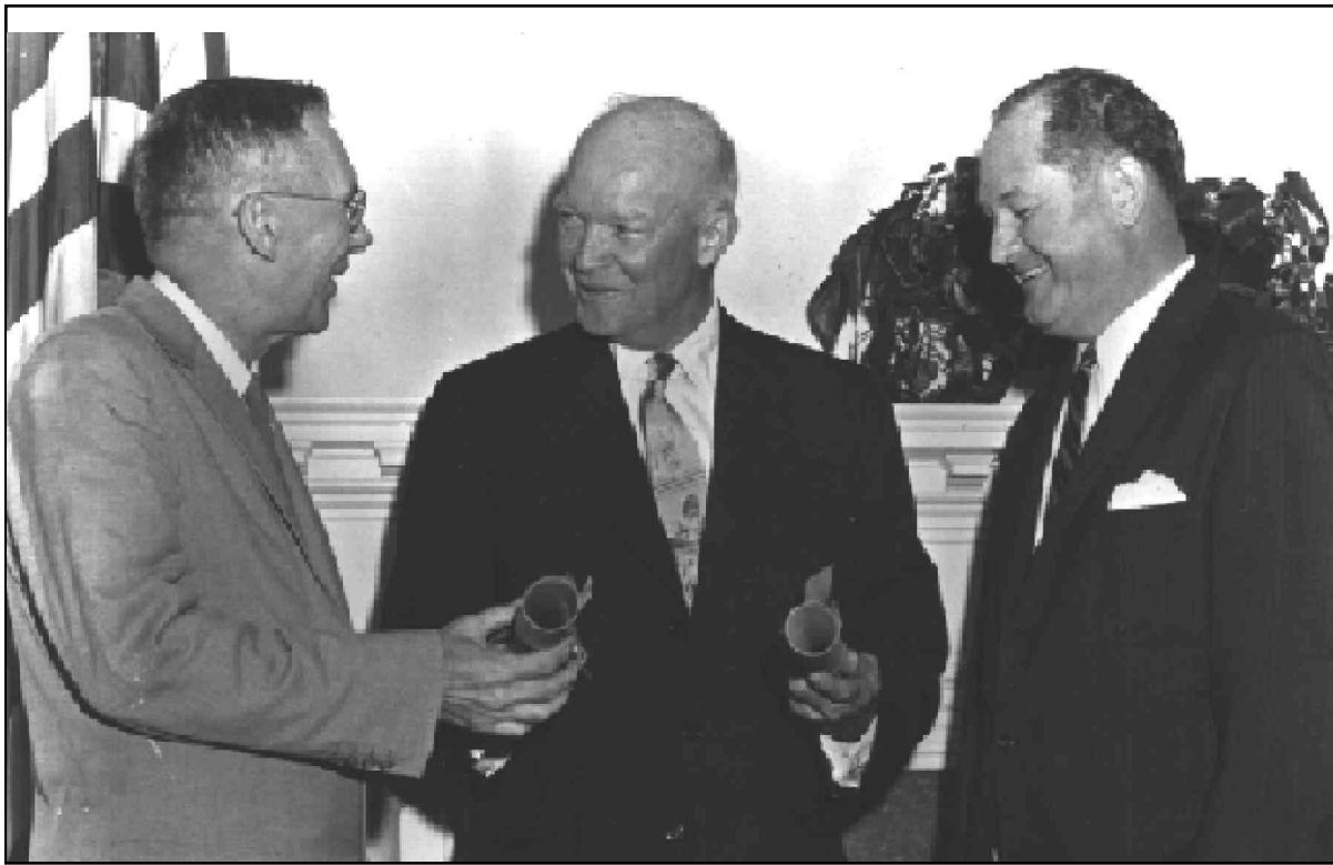
With the passage of the National Aeronautics and Space Act of 1958, and NASA's establishment on October 1, 1958, President Eisenhower appointed T. Keith Glennan (right) as administrator and Hugh L. Dryden (left) as deputy administrator.

ninety minutes or less they just automatically went over national boundary lines. They couldn't do anything about that.