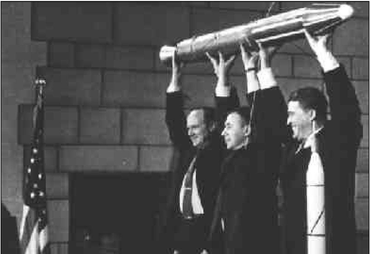
Dr. William H. Pickering, director of the Jet Propulsion Laboratory; astrophysicist Dr. James A. Van Allen, University of Iowa; and Dr. Wernher von Braun, director of the Army's Redstone launch vehicle program, announced on February 1, 1958, at the National Academy of Sciences that they had successfully launched the first U.S. satellite, Explorer 1. This was the signature image that appeared in newspapers around the nation the next morning, but this success also served notice that the nation had to codify the authority for space exploration in a single organization.

Stever: I know, but that was the big transfer. By the way, von Braun was on the NACA Committee. Both he and Pickering seemed a little bit reluctant in the discussions. But,