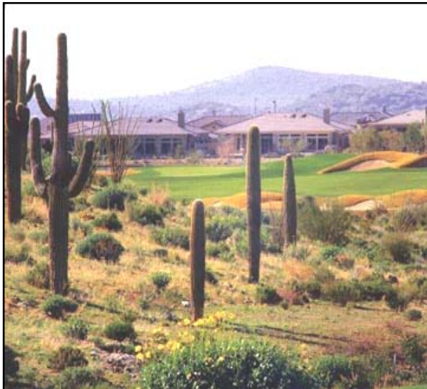
Arizona golf course with native plant landscaping.

Urban communities are expanding due to growing populations nationwide. More homes, schools, shopping centers and roads are connecting people to desired services. Urban landscapes have different resource concerns than rural landscapes. Urban communities experience significantly more impervious surfaces. Rooftops, roads, parking lots, and compacted areas increase surface runoff and deliver more sediment, nutrients, hydrocarbons and other pollutants to receiving bodies of water. Urban landscapes often experience greater populations of invasive species and weeds that increase the potential of damaging wildfire.