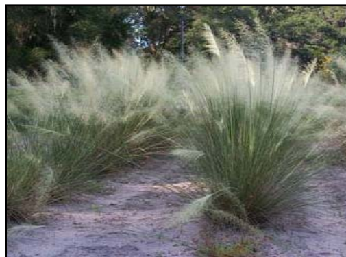
The white flower heads of Morning Mist Germplasm hairawn muhly make it valuable as a drought tolerant landscape plant.

Many of the Plant Materials Programs 600+ conservation plant releases can and are used to create colorful low water-use, drought tolerant, sustainable landscapes. Native plants released by the Program are often more fire resistant and remain green longer than invasive species.