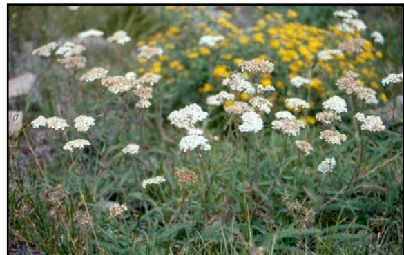
Great Northern Germplasm western yarrow, released by the Bridger, Montana Plant Materials Center, is a drought tolerant forb.

The Plant Materials Program is helping meet the NRCS goal by selecting adapted plants and developing plant technology that can be used to improve the quality of urban landscapes.