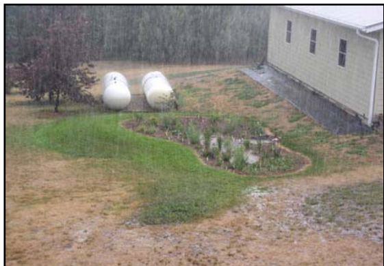
A rain garden captures roof runoff from a ½ inch, 15-minute prairie thunderstorm. Note the drought stressed area outside the rain garden.

The Plant Materials Program is involved in native landscaping and xeriscaping. Native plants have a tremendous root architecture that builds soil quality and increases organic matter. Increasing organic matter content improves the water holding and infiltration capacity of the soil.