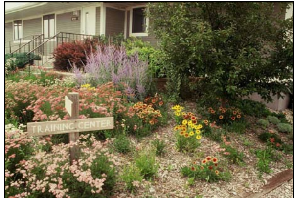
Urban landscaping at the Bismarck, North Dakota Plant Materials Center

and allow it to slowly infiltrate into the vegetative filter. Nutrients in the runoff are also taken up by the plants. Bioretention cells are shallow landscape depressions that often handle large volumes of water from nearby impervious surfaces. Rain gardens are perennial vegetation strategically located to capture runoff from impervious surfaces such as rooftops, driveways, and patios. Plant materials used in these situations can also provide valuable habitat for wildlife and pollinators.