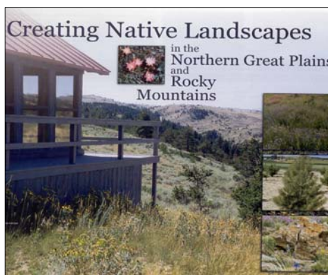
This booklet is a product of the Plant Materials Center in Bridger, Montana.

In addition to plant releases, the Plant Materials Program has released several documents which are very useful to homeowners in all regions of the country. These publications provide solutions or guides for improving plant communities for homeowners and municipalities. These guides provide many ideas on conserving soil and improving water quality.