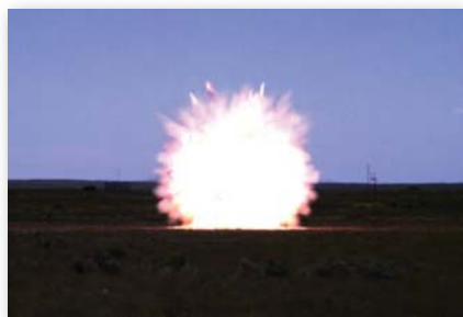
Outdoor Testing of up to 50 lb of Explosive

The NEXESS Center team has existing technical staff/facilities and has historically performed foundational work in many of the disciplines for DHS and related customers to meet this mission. The NEXESS Center team also has very strong working partnerships with the National technical community working on explosive sciences and detection technologies, and can partner with these National/Federal Labs and academia when needed to form the best possible team of experts. The NEXESS Center will integrate key intelligence threads to provide an informed analysis that defines the Nation's current security/risk status, provides insights into future explosive threats, and identifies key S&T investment strategies needed to mitigate the terrorist explosive risk.