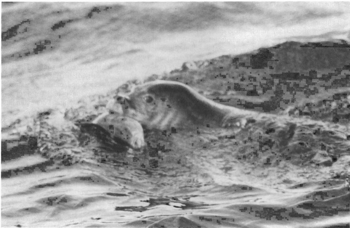
Figure 1.—Hawaiian monk seal consuming a discarded kahala.