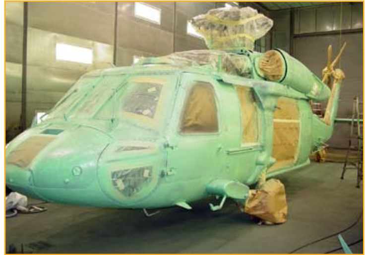
The UH 60 Blackhawk has non-chrome primer applied, which has improved adhesion over other existing primers.

The AVCRAD Quality Control Office is the initial receiver of all Mil-Spec standards, technical manuals, maintenance requirements, etc. This office reviews all incoming material and disseminates the relevant information to top management. The management then distributes it to the end use level. This information includes requirements for the use of regulated substances or environmentally friendly alternative products. The AVCRAD utilizes internal Environmental Management System management review procedures to identify where environmentally friendly alternative products are approved for use and eliminate language requiring the use of regulated substances where approved. They then initiate the removal of language that previously called for the use of regulated products from all internal documents.