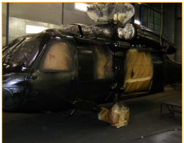
The non-chromium-6 primer painted on this UH 60 Blackhawk helicopter is effective and safer for the environment.

The test program used two different epoxy-based primers. One was a solvent-based product conforming to MIL-PRF-23377 Type I Class N, and the other was a water-reducible product conforming to specification