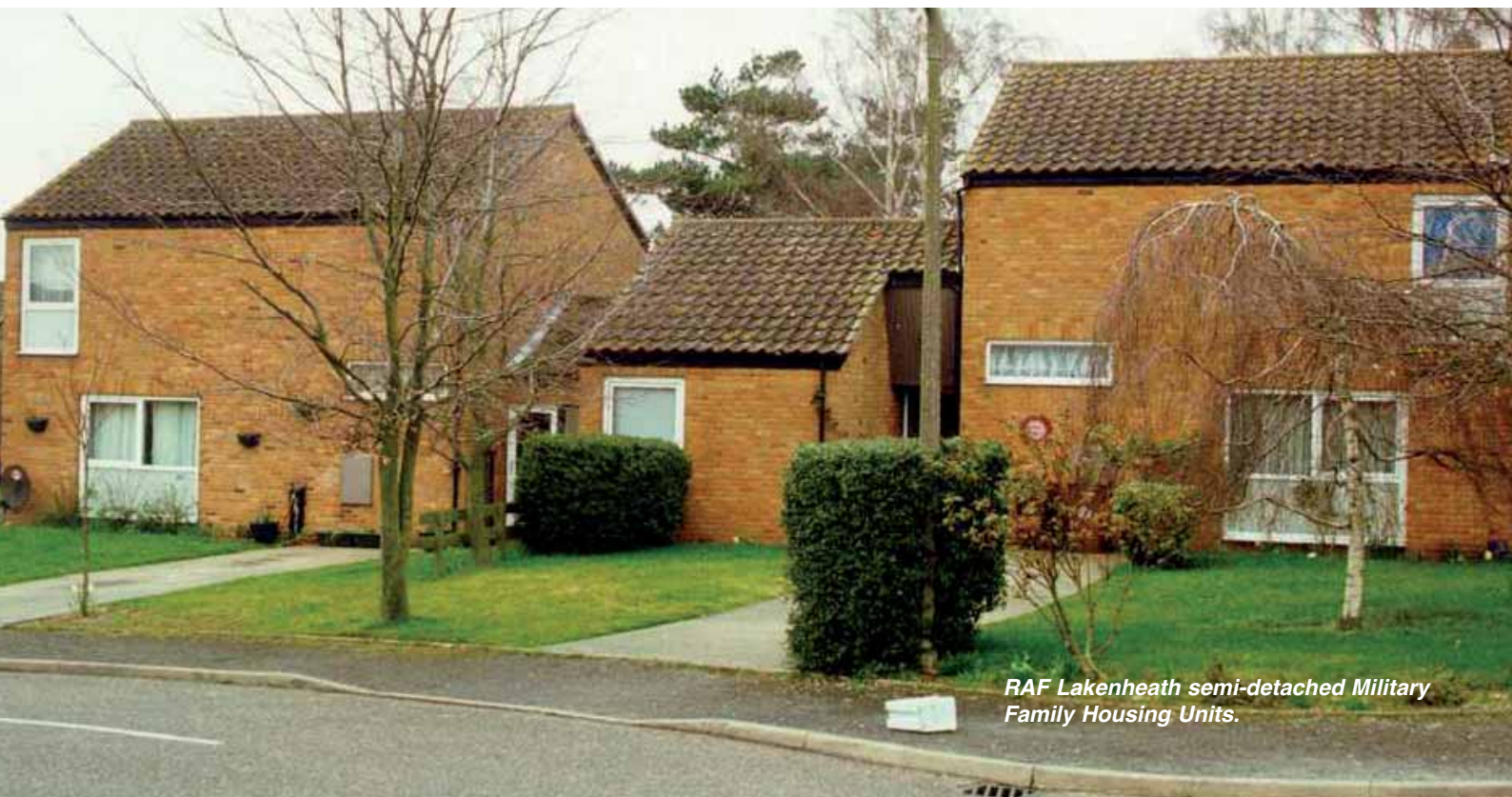
RAF Lakenheath semi-detached Military Family Housing Units.

The current average rental prices for homes are two-bedroom home –$875; three-bedroom home –$1053; and four-bedroom home –$1769. All rents are per calendar month and are paid in advance by the tenant. Rents shown