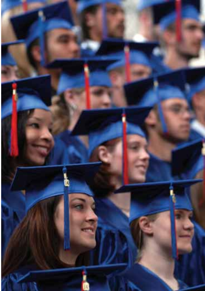
Lakenheath High School graduation.