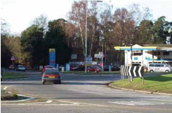
Roundabouts are very common throughout England. Traffic flows clockwise so drivers must yield to traffic to the right.

The correct insurance coverage is the responsibility of both the borrower and the owner of the vehicle. Both persons can lose their driving privileges for non-compliance. Before lending out your vehicle or borrowing a vehicle, ensure you and they are covered. If not, and you're stopped and charged, you will be fined, plus your USAFE driving permit will be revoked for a minimum of 18 months.