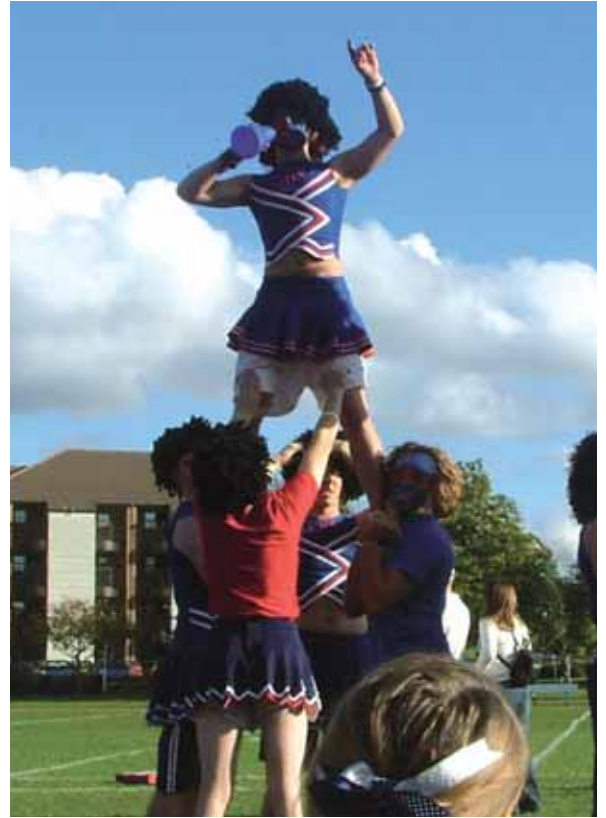
Powderpuff, a Lakenheath High school tradition have football players dress up as cheerleaders and learn cheer stances during Homecoming week.

Once the housing area and school zone are determined, the sponsor should report to the appropriate school office and complete the registration forms. Registration forms may be accessed at www.lakenheath.af.mil/libertykids . Registration for new students takes place year-round.