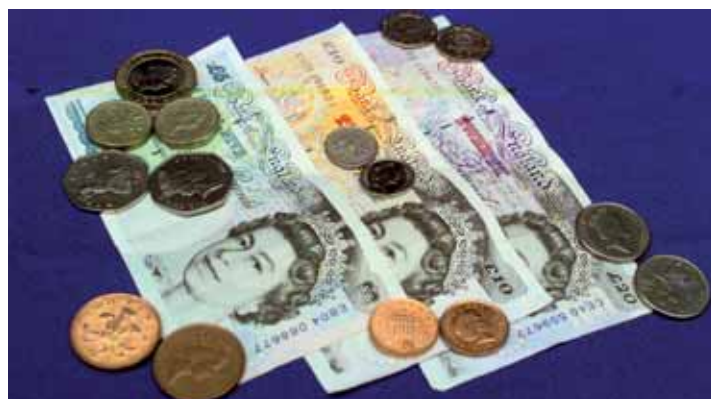
British pounds Sterling

Money can be changed from pounds to dollars and vice-versa at Community Bank, the credit union or the clubs on