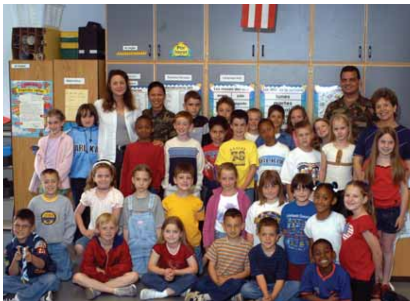
The Lakenheath Elementary School includes Spanish immersion classes.

pupils. The school hosts kindergarten through third grade, as well as the Pre-school Children with Disabilities program and Sure Start. The LES program includes two host-nation teachers who introduce British history, culture and customs, as well as physical education, art and music classes. Located in the RAF Lakenheath housing area, the school serves children from RAF Lakenheath and RAF Mildenhall personnel living in the catchment area from Lakenheath to the south.