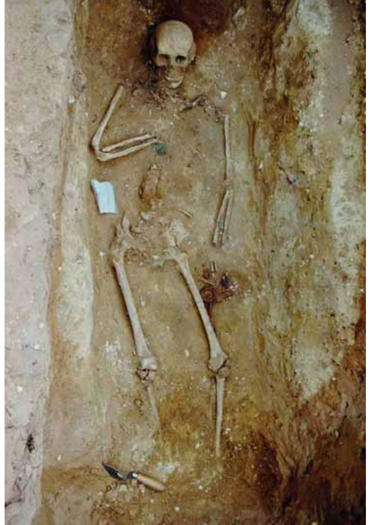
Remains found during archeological dig at RAF Lakenheath.

Roman pottery and bronze have also been found throughout the base, suggesting that RAF Lakenheath may have been a strategic point for legionnaires in the area. The old Brandon turnpike, which originally ran through the middle of Hangar 7, was a Roman thoroughfare and connected several forts south with a number of Roman settlements in the north. Roof