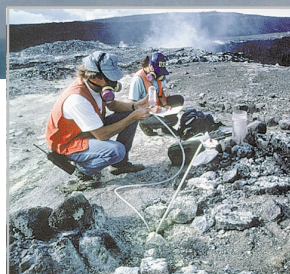
Kīlauea Volcano on the Island of Hawai‘i emits about 2,000 tons of sulfur dioxide (SO 2 ) gas each day during periods of sustained eruption. Air pollution caused by SO 2 and other volcanic gases became a frequent problem on the island in mid-1986, when the volcano’s ongoing eruption, which began in 1983, changed from episodes of spectacular lava fountaining (shown here) to a nearly constant but quiet outflow of lava and gas. Inset shows U.S. Geological Survey scientists sampling volcanic gases from Kīlauea.

tons of irritating sulfur dioxide (SO 2 ) gas each day during periods of sustained eruption. Deep inside the volcano, where pressure is high, the SO 2 is dissolved in molten rock (magma). When the magma rises toward the surface, where pressure is lower, the gas bubbles out and escapes.