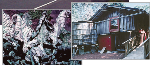
Sulfur dioxide gas and other pollutants emitted from Kīlauea Volcano interact chemically with atmospheric moisture, oxygen, dust, and sunlight to produce volcanic smog (vog) and acid rain. Vog poses a health hazard by aggravating preexisting respiratory ailments, reduces driving visibility (top), and damages crops (lower left), and acid rain can leach lead from rainwater catchment systems (lower right) into household water supplies.