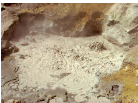
The vigor of Lassen’s hydrothermal features, such as this mudpot, varies seasonally. In spring, when cool ground water from snowmelt is abundant, fumaroles and pools have lower temperatures, and the mud in mudpots is more fluid.

The remarkable hydrothermal features in Lassen Volcanic National Park include roaring fumaroles (steam and volcanic-gas vents), thumping mudpots, boiling pools,