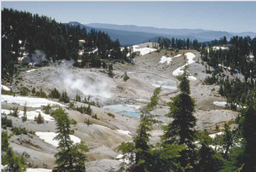
The hottest and most vigorous hydrothermal features in Lassen Volcanic National Park are at Bumpass Hell, which marks the principal area of upflow and steam discharge from the Lassen hydrothermal system. A prominent steam plume marks the site of Big Boiler, the largest fumarole (steam and volcanic-gas vent) in the park. The temperature of the high-velocity steam jetting from it has been measured as high as 322°F (161°C). Most of the hydrothermal features in the park contain mixtures of condensed steam and near-surface ground water and have temperatures that are near boiling. The steam-heated waters of the features are typically acidic and, even if cool enough, are not safe for bathing.

H ydrothermal (hot water) features at Lassen Volcanic National Park fascinate visitors to this region of northeastern California. Boiling mudpots, steaming ground, roaring fumaroles, and sulfurous gases are linked to active volcanism and are all reminders of the ongoing potential for eruptions in the Lassen area. Nowhere else in the Cascade Range of volcanoes can such an array of hydrothermal features be seen. Recent work by scientists with the U.S. Geological Survey (USGS), in cooperation with the National Park Service, is shedding new light on the inner workings of the Lassen hydrothermal system.