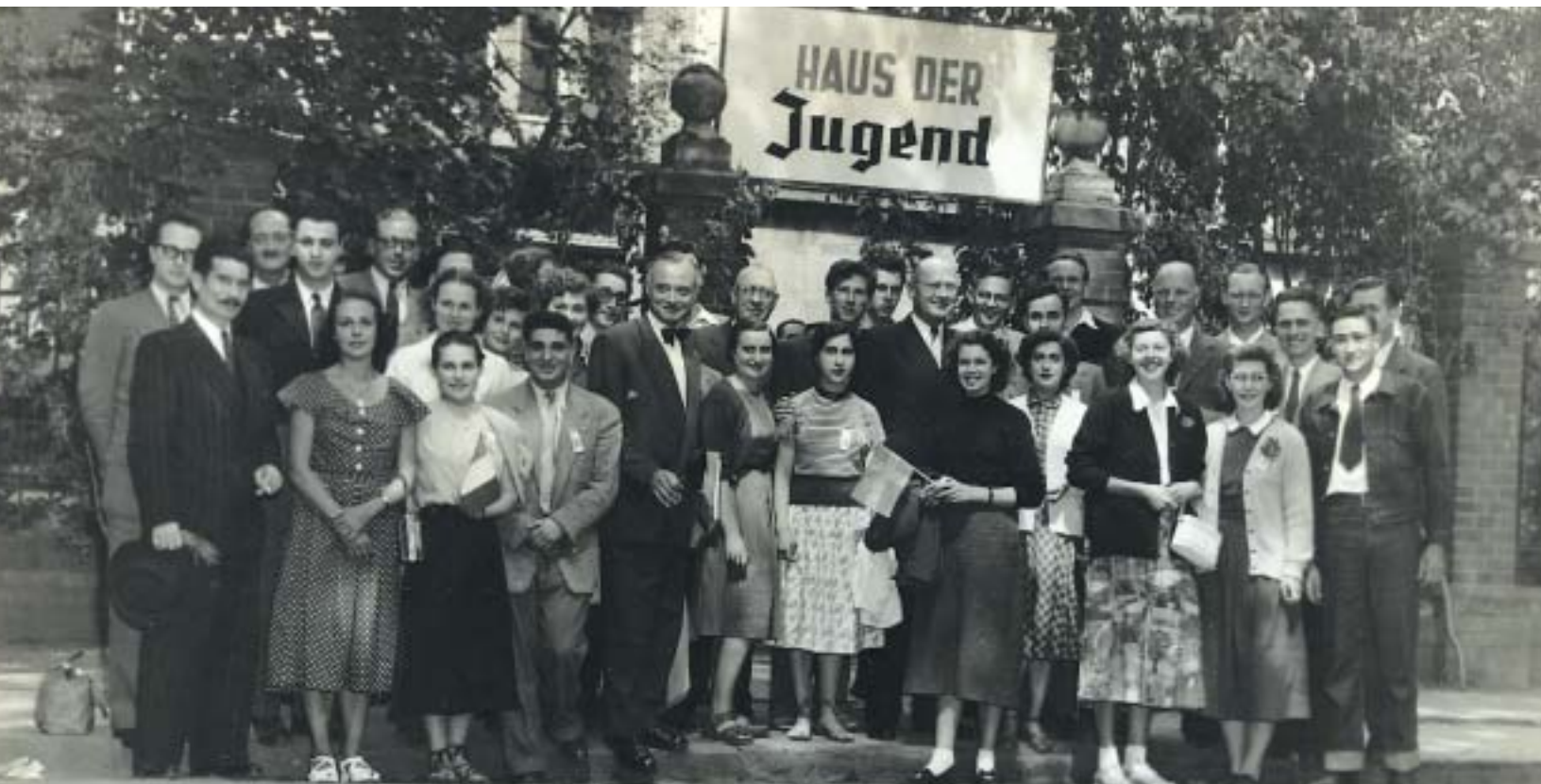
European Youth Week in Fritzlar, the American Sector of Germany, an activity sponsored by a resident officer of the class of 1950 as part of the effort to bring European young people together in the postwar period.

Mayors and local officials welcomed the visitors warmly. One class member, who had served in the town of Buchen in what is now the state of Baden-Württemberg, made a special effort to visit the orphanage run by a Catholic priest, his closest German friend.