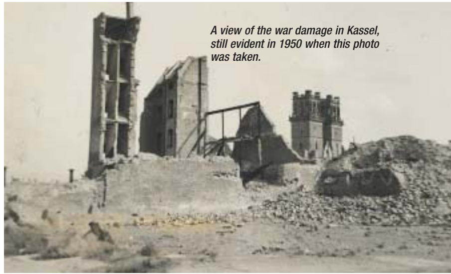
A view of the war damage in Kassel, still evident in 1950 when this photo was taken.

In 1990, the class celebrated its 40th anniversary in Dinkelsbühl in the southern German state of Bavaria. When the reunion was over, many returned with their wives for the first time to their previous stations. The towns they remembered as struggling, almost poverty-