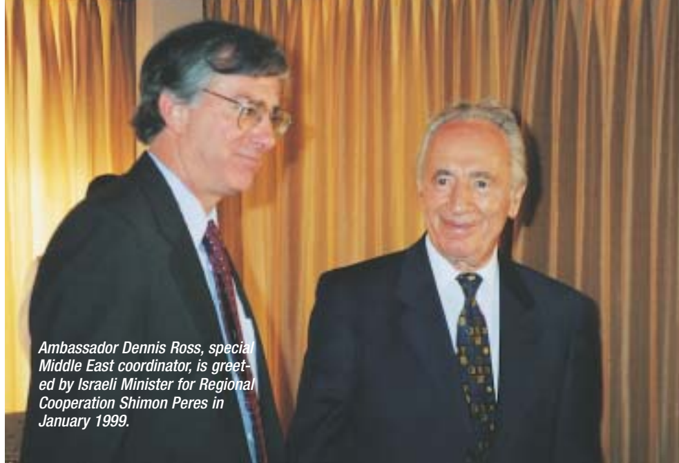
Ambassador Dennis Ross, special Middle East coordinator, is greeted by Israeli Minister for Regional Cooperation Shimon Peres in January 1999.

with the Gulf Cooperation Council states and safeguarding world access to the substantial energy resources from that area. NEA countries account for more than 75 percent of proven world oil reserves. Since Saddam Hussein's invasion of Kuwait in 1990, the bureau has coordinated closely with the Defense Department on an enhanced forward presence for U.S. military assets, and regional diplomacy is heavily oriented toward ensuring that those assets support our overall security priorities.