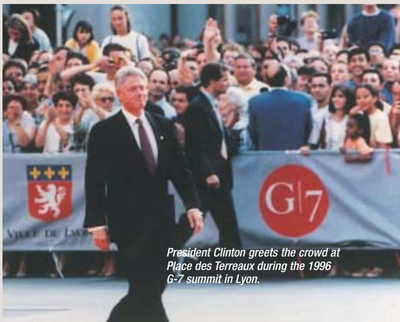
President Clinton greets the crowd at Place des Terreaux during the 1996 G-7 summit in Lyon.

But for all that glitters here, the culinary cognoscenti still know Lyon for its stars of the Michelin variety. Home to master chefs Paul Bocuse and Pierre Orsi and a short ride away from three-star restaurants Troisgros of Roanne and Blanc in Bourg-en-Bresse, Lyon probably has more fine restaurants per capita than anyplace on the planet. Accompanied by wines from the nearby Beaujolais—known locally as Lyon's third river—it's easy to understand why a tour in Lyon is easy to digest.