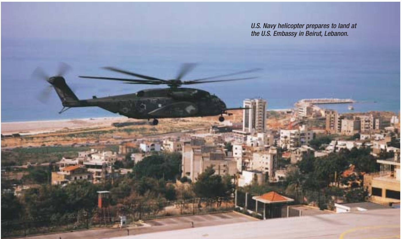
U.S. Navy helicopter prepares to land at the U.S. Embassy in Beirut, Lebanon.