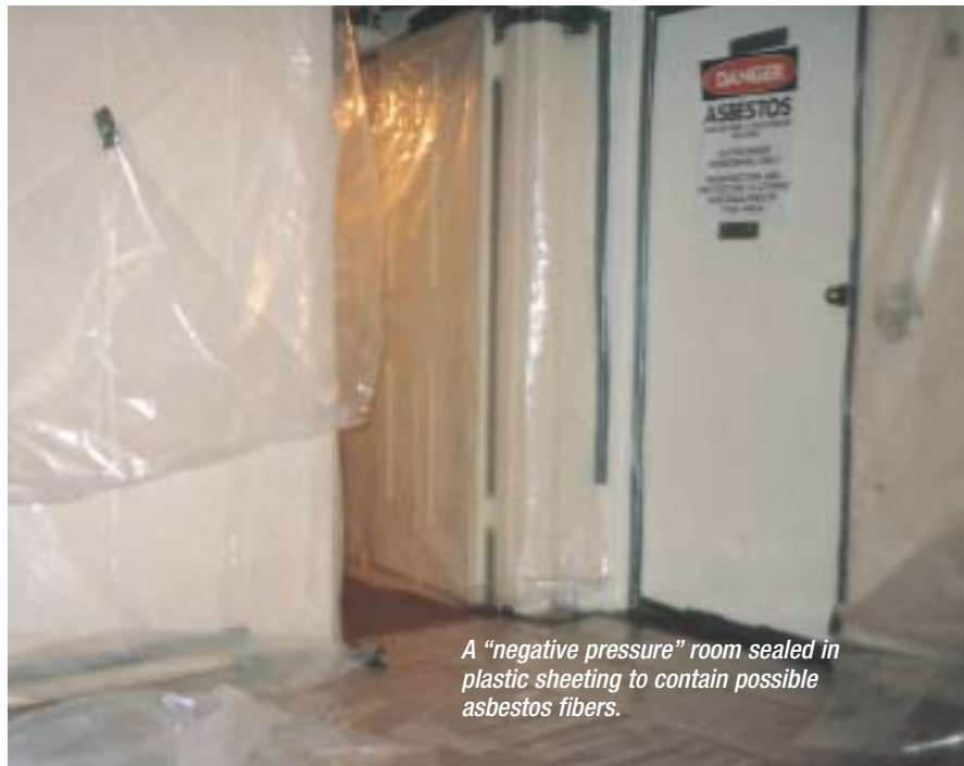
A "negative pressure" room sealed in plastic sheeting to contain possible asbestos fibers.