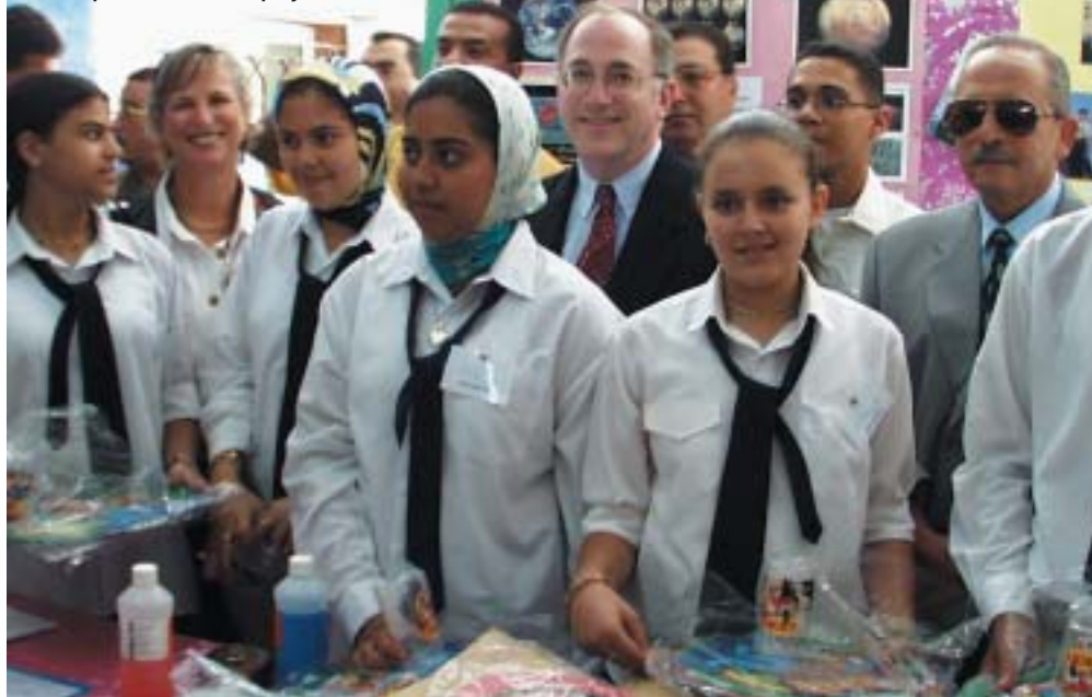
Daniel Kurtzer, center, U.S. Ambassador to the Arab Republic of Egypt, and Mrs. Kurtzer visit a U.S. Agency for International Development education project in Port Said.

North Africa has suffered economic dislocation and political tension as its countries make the difficult transition toward more open, democratic governance. U.S. policies aim to bolster the efforts of moderate, constructive governments in Morocco and Tunisia and reinforce change in Algeria. The bureau has begun an initiative in North Africa that gives new coherence to this approach and in FY 2000 will inaugurate a cutting-edge program to support private sector trade—not a traditional aid program—that will enhance investment opportunities and build civil institutions. The importance of this effort to long-term stability and U.S. business far exceeds its costs.