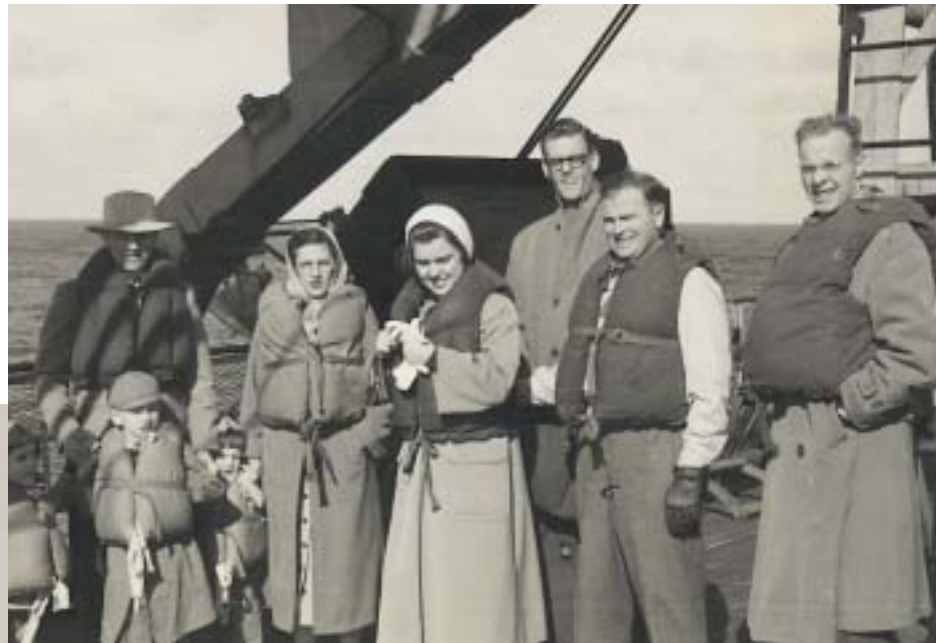
The class of 1950 and their families don life jackets in an emergency drill aboard the troopship Henry Gibbins en route to Bremerhaven.