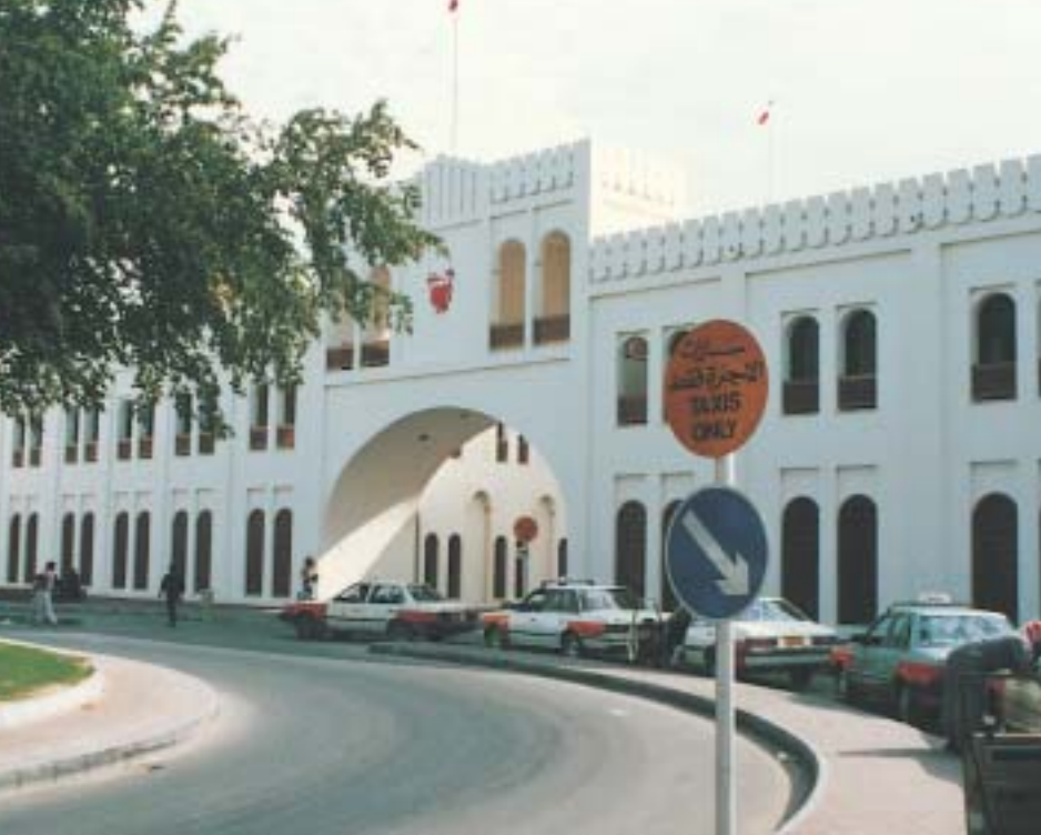
The Bab al Bahrain, gateway to the Manama souk.

The Bahrainis themselves, however, are probably the country's greatest attraction. They are warm, friendly, humble and hospitable to strangers, characteristics cultivated over centuries as a regional trading post. They are also very generous with their time and possessions. It is not unusual for a rug or jewelry vendor to take a new customer out for lunch. Tea, coffee and sweets are routinely offered to visitors.