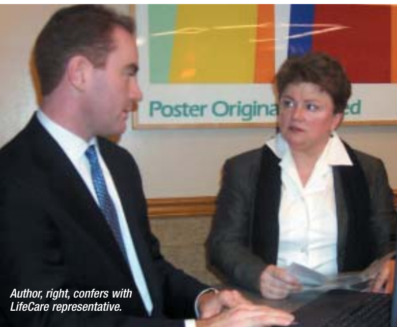
Author, right, confers with LifeCare representative.

If you are having trouble accessing or using the site, please call the LifeCare.Net help desk at (888) 604-9565.