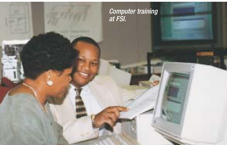
Computer training at FSI.