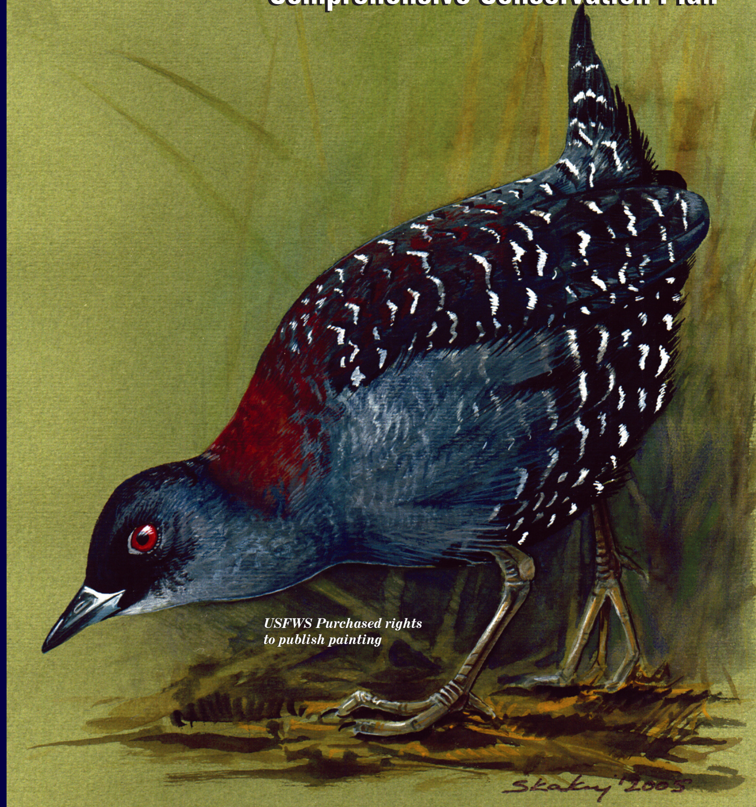
USFWS Purchased rights to publish painting