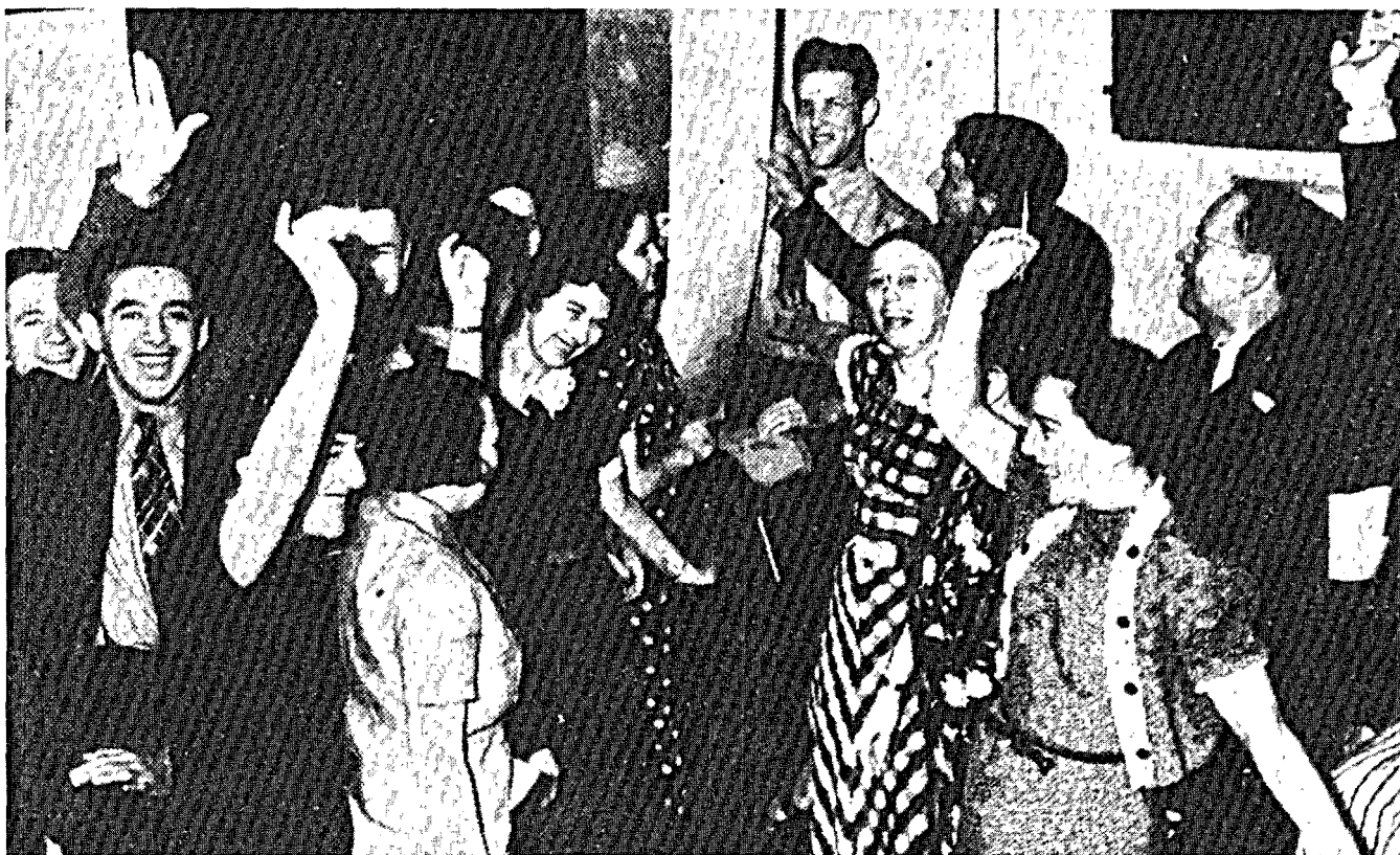
It's 1937, and Social Security workers are jubilant after learning that the Social Security Act had been declared constitutional.

The committee report on *Roosevelt's Court-packing plan was issued in March 1937, at the same time the Court had under consideration the constitutional-