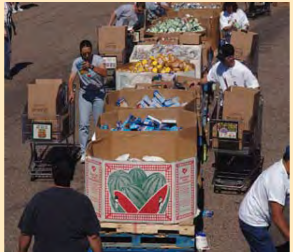
Volunteers from Logistics compete in the Food Boxing Olympics

Feeding New Mexico's hungry is the year-round mission of Roadrunner Food Bank. Sandia National Laboratories/Lockheed Martin provides year-round support. The year began with a $10,000 corporate donation. Corporate food drives brought in 23,000 pounds of food, including 120 turkeys in celebration of Take A Turkey to Work Day. Volunteers stepped in to sort food at the Mail Carrier's Drives and Sortin Sundays and to staff the Souper Bowl fundraiser. Finally, a Sandia team participated in the first annual Food Box-ing Olympics, a competitive event resulting in the packing of 572 special diet food boxes for seniors.