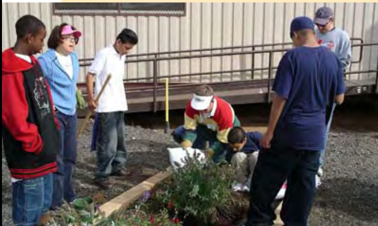
Volunteers and students landscape the campus at Vision Quest Alternative School.

Sandia National Laboratories and our employees believe in volunteering in our community. This year, over 3000 volunteers celebrated Albuquerque's Make a Difference Day. Sandia Serves volunteers could be found outdoors landscaping and painting at 3 schools and cleaning trails at the Robert J. Nicodemus Memorial Wilderness Project. Some worked at home folding ribbons for Mother's