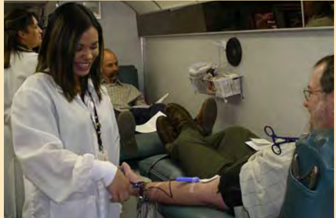
Donating blood is a great way to help others.