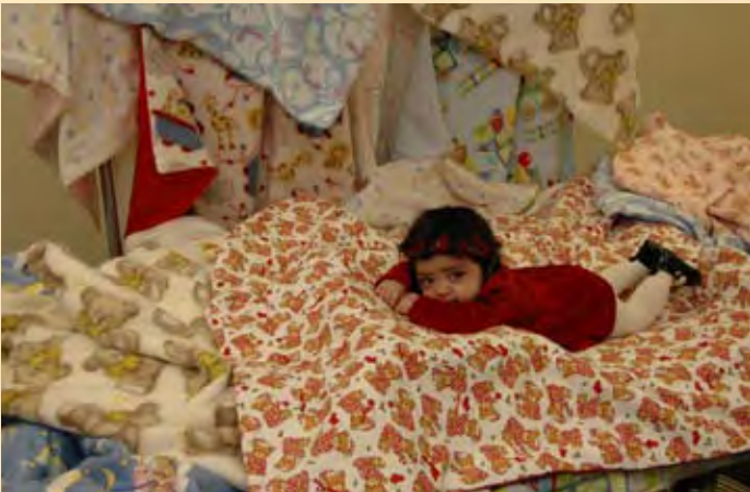
Sewing Sandia Serves volunteers provide blankets for children in need.

On the first Saturday of every month, a group of Sandians who enjoy sewing get together to make blankets for Project Linus. Since September, the group has made over 45 blankets. These beautiful, handmade blankets are given by Project Linus to children who are seriously ill, traumatized, or otherwise in need.