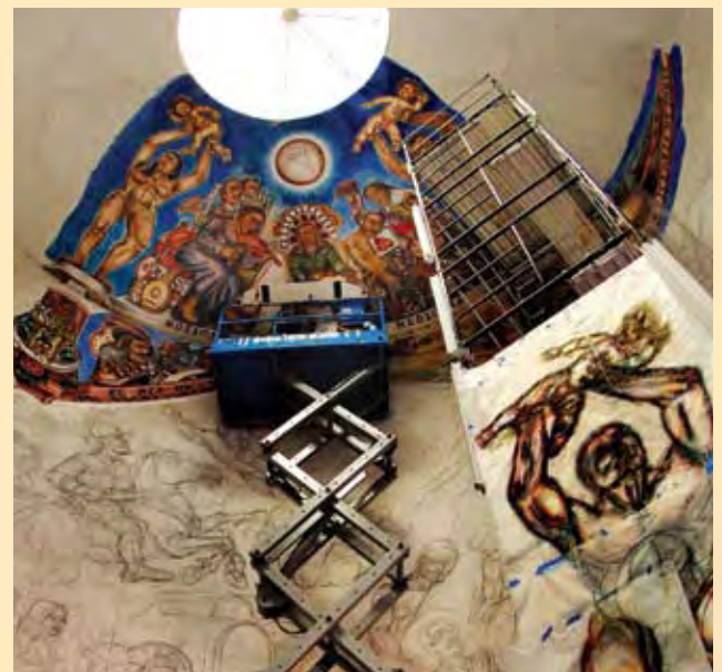
Lockheed Martin has contributed $100K to the National Hispanic Cultural Foundation over a 3 year period.

Lockheed Martin Corporation on behalf of Sandia National Laboratories donated $2.3M to non-profit organizations in support of programs benefiting the Middle Rio Grande Community during 2005. The focus of contributions is on projects and programs that encourage the development of youth in our community so that the next generation workforce is skilled, educated, and maintains values important to our community. Grants are made in five areas which include Education, Arts & Culture, Civic and Public Interest, Health & Human Services and Volunteerism. Examples of some of the 169 supported programs include local museums educational programs, mentoring programs, literacy programs, science and math competitions, music programs in schools, teacher professional development and the Albuquerque Tricentennial Celebration. Organizations interested in applying for Lockheed Martin / Sandia National Laboratories corporate contributions can find more information on Sandia's Web site at http://www.sandia.gov/about/community/index.html .