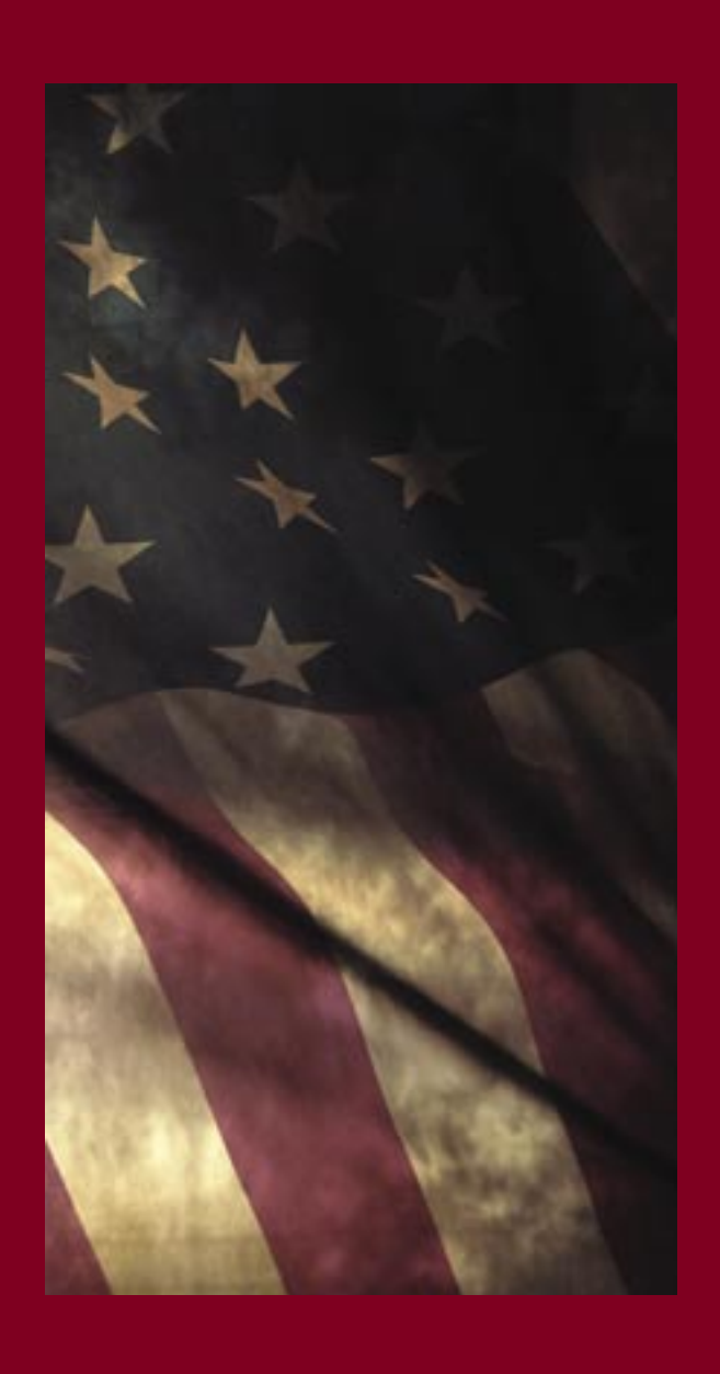
U.S. Small Business Administration www.sba.gov/reservists 1-800-U ASK SBA