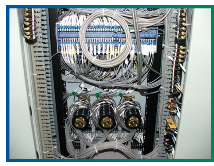
A NETWORK OF INTERIOR PANEL WIRING CONNECTS THE NEW PROTECTIVE RELAYS FOR CANNON'S UNIT # 2.

Southwestern and the St. Louis District of the U.S. Army Corps of Engineers (Corps) teamed up in late 2005 and early 2006 to replace outdated relays and related equipment at Clarence Cannon Dam in Monroe City, Missouri.