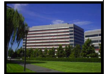
Figure 1. Three of five buildings participating in the first successful test of a multi-building internet demand-response control system: The Ronald V. Dellums Federal Building, Oakland; University of California, Santa Barbara; and Bank of America, Concord, California.