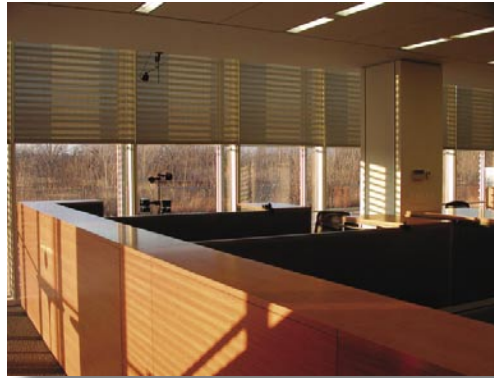
Figure 2. A shading system candidate for the new New York Times building undergoes testing in College Point.

An unusual feature of the building, more commonly seen in Europe than in the U.S., will be its fully glazed curtain wall. Thin horizontal ceramic tubes placed on a steel framework one and a half feet in front of the glass will screen the building’s full height wall of double-glazed, spectrally selective, low-emissivity glass,