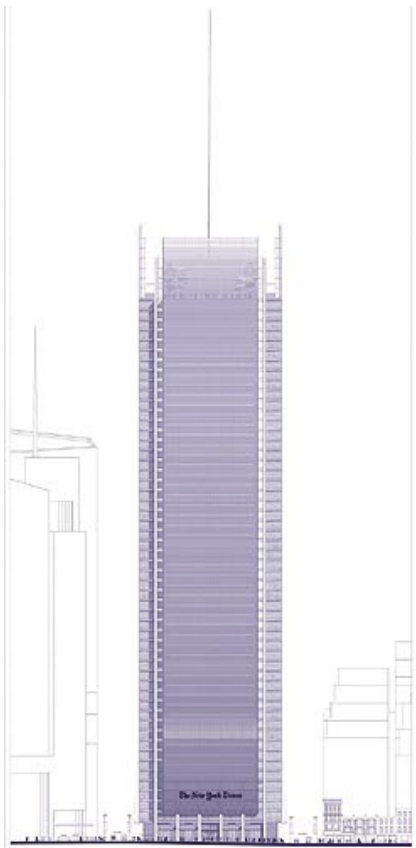
Figure 1. Artist rendering of the New York Times' new headquarters in Manhattan.

"We've known since the 1970s that daylighting can reduce lighting energy use," says Selkowitz. "But the mere use of large glass areas is not in itself a guarantee that energy savings or comfort will be achieved because there are so many tradeoffs involved. It's been difficult to make as much progress in the use of daylighting as we have in other areas of lighting and glazing technology for a variety of reasons. Daylighting requires a high level of system integration; architects and engineers have to design the building from the start to incorporate daylight into office spaces, there has to be a flexible and responsive control strategy to lower