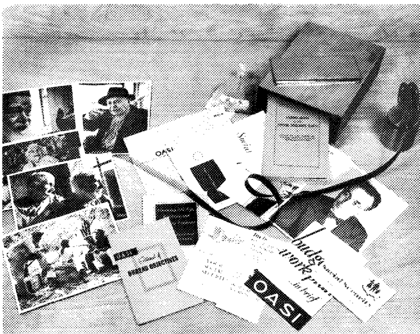
Contents of the "time capsule" beneath the cornerstone of the Altmeyer Building.

The box is to be opened only when these massive buildings at headquarters have served their purpose, fallen victim to time, and are ready to be demolished and replaced. That's not expected to happen for many, many years to come. And while you won't be around for that occasion, you can imagine just how quaint and historically interesting that box will be by then, □