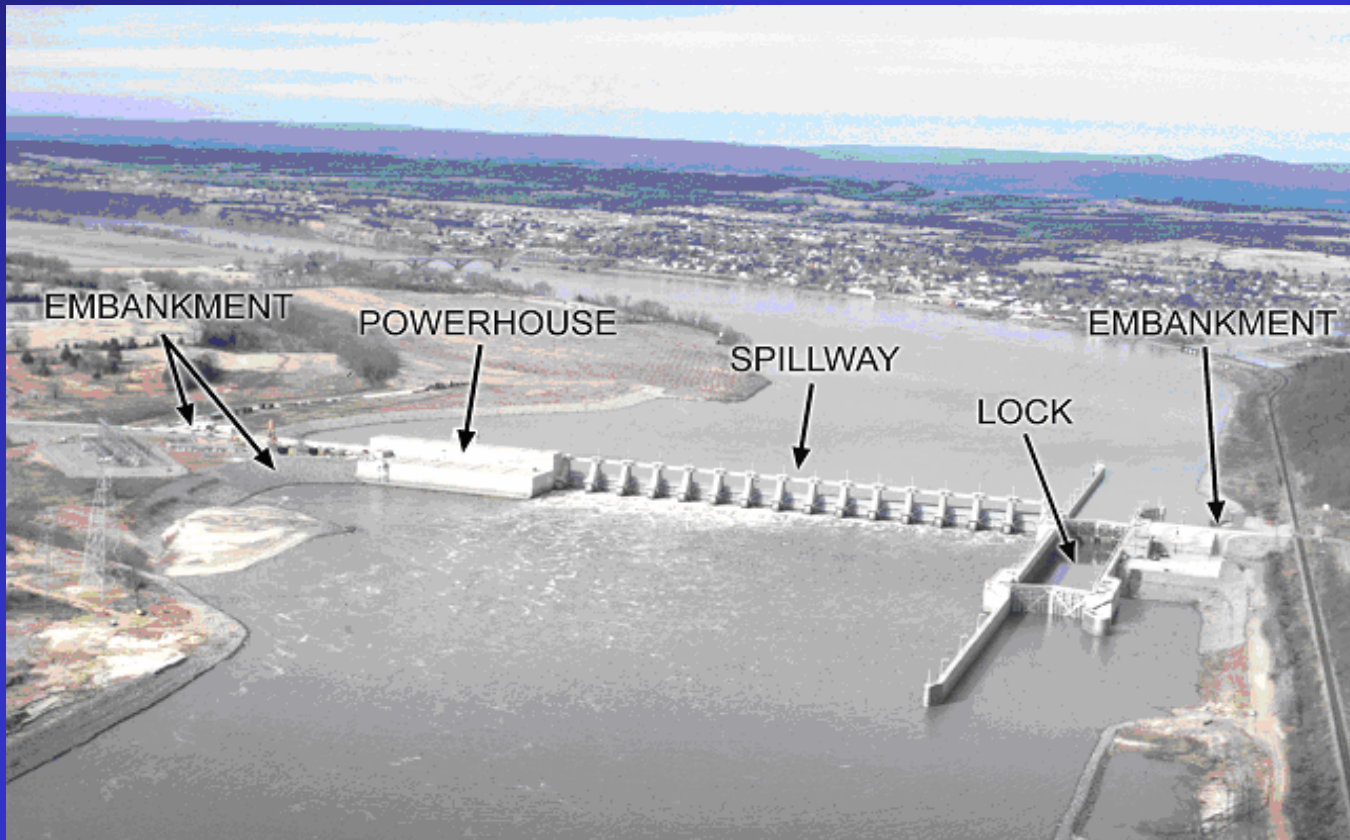
Ozark Jeta Taylor Lock, Dam and Powerhouse One Corps Serving The Army and the Nation