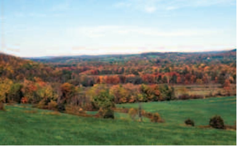
Hillside with fall foliage

hawk, and broad-winged hawks fill the sky on clear September days. Short-eared owls, northern harriers, and rough-legged hawks are found primarily during the winter.