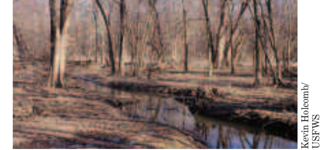
Bottomland hardwood forest