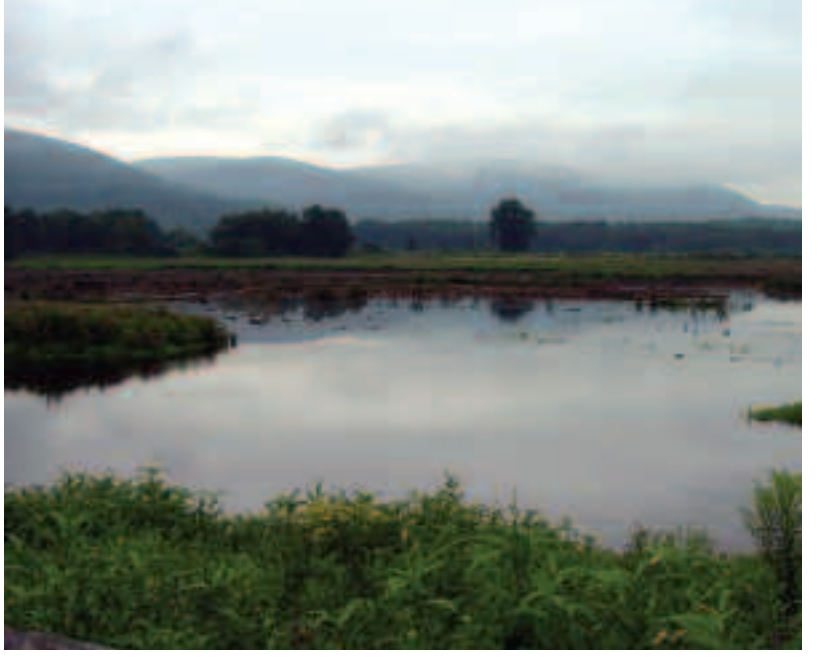
Impoundment Edward Henry/USFWS

A total of 225 species of birds occur on the refuge, including 19 species of waterfowl, 35 species of waterbirds, 24 species of raptors, and 125 species of songbirds. Red-winged blackbirds and the spectacular courtship display of the American woodcock harken spring's arrival. Also common during spring migration are wading birds such as the greater and lesser yellowlegs.