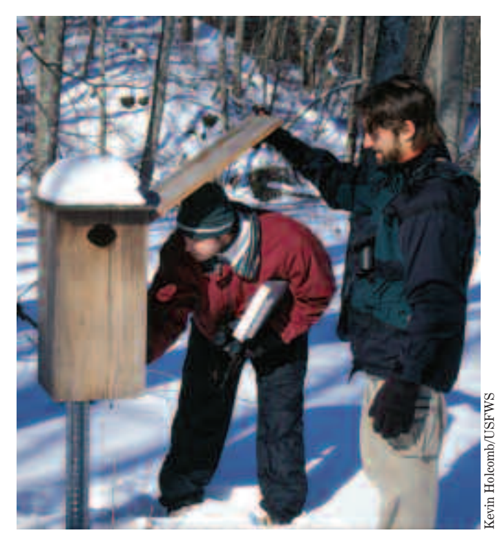
Volunteers checking wood duck boxes

Sussex County Chamber of Commerce 973/579 1811