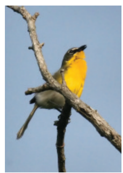
Yellow breasted chat