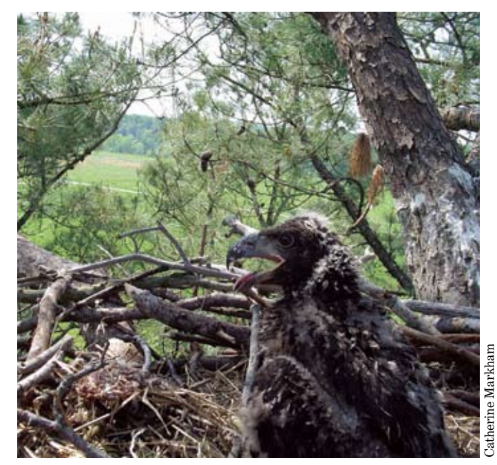
Newly hatched bald eagle

Established in 1996, our goal is to protect 20,000 acres of important wetland and upland habitat along the river and its major tributaries. With help from our conservation partners, including Chesapeake Bay Foundation, The Conservation Fund, The Nature Conservancy, and The Trust for Public Land, we are well on our way toward achieving our land protection goal, which includes the purchase of conservation easements.