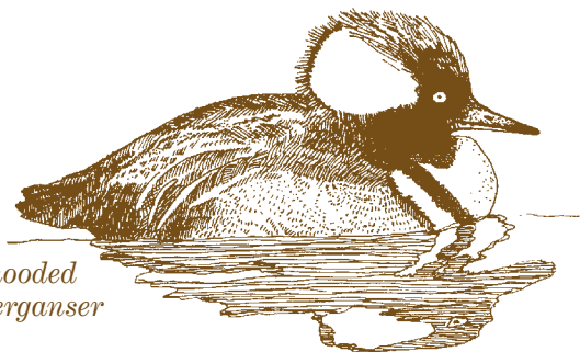
Male hooded merganser

This trail parallels the woods' edge as it wanders through a forested wetland to a pond where one may observe waterfowl and waterfowl management. An outdoor environmental area is available to educational groups. Access to the Cash Lake and Laurel trails begins here.