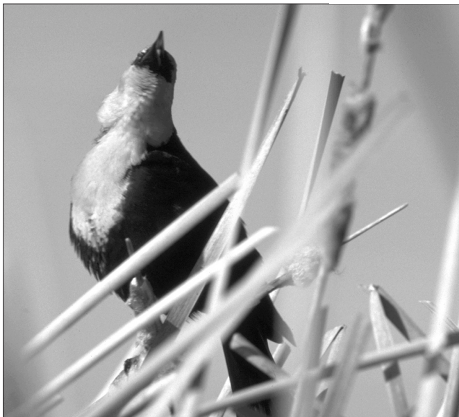
Yellow-headed Blackbird