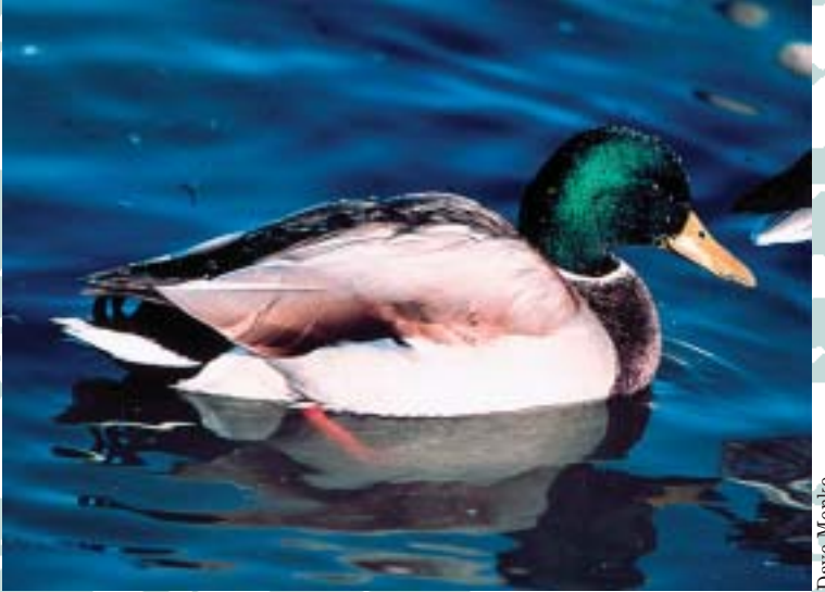
Mallards are among the most common waterfowl found on the refuge. In the spring, they can often be seen swimming in pairs.

The public is encouraged to visit the refuge and participate in the many activities designed and offered for outdoor enjoyment. Wildlife observation, fishing, hiking, nature study, and hunting of small game and deer are just a few of the opportunities available. The Visitor Center located on Highway 67 two miles west of I-65 should be the first stop for all visitors planning a trip to the refuge. At the Visitor Center, visitors can obtain information about the refuge, enjoy the exhibits, watch the orientation video, use the observation building and trails, and find out about other interesting activities that might be available.