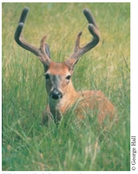
White-tailed deer in velvet

White-tailed deer and other resident species may be visible in refuge habitats in virtually any season.