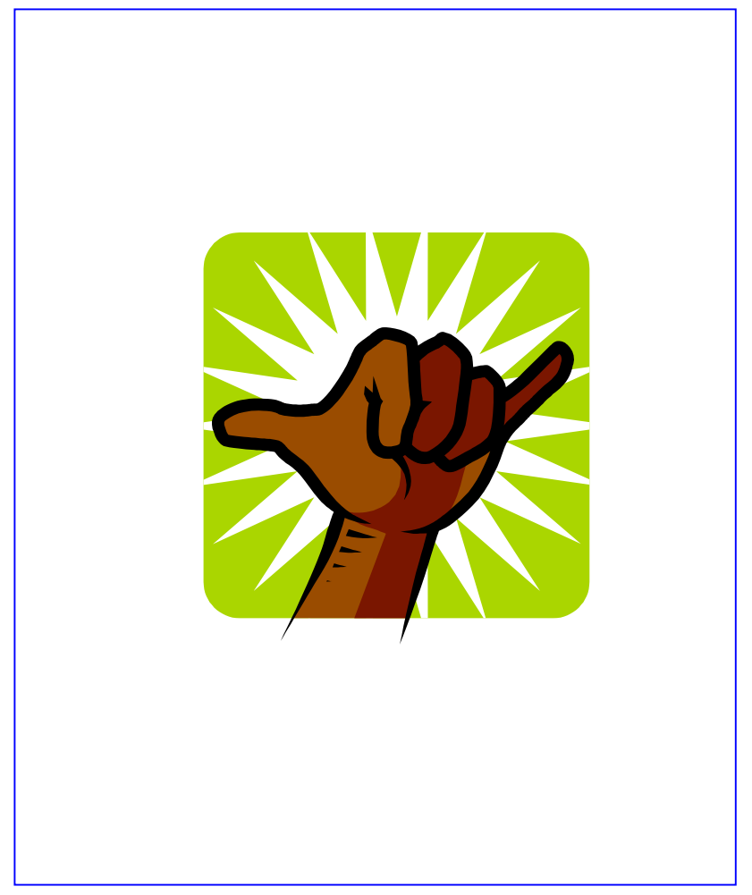
Thanks for Complying with the Law.