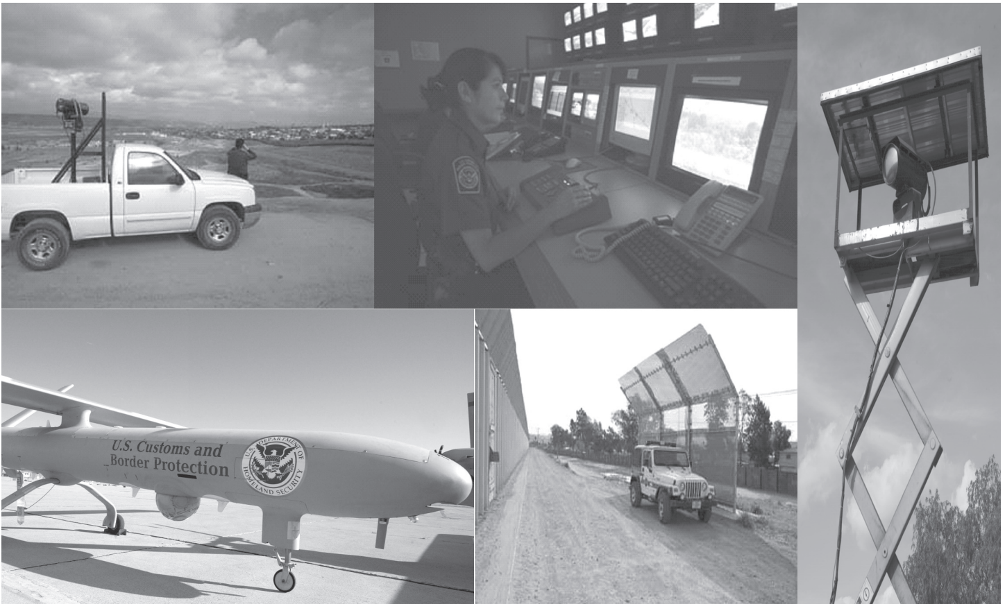
Figure 1: Existing Technology along the Border