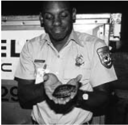
Inspection, Asian Box Turtle.

For our entry-level biological and natural resource positions, you must have a Bachelor's degree in biological science or natural resources management from an accredited college or university. This degree qualifies you for one of our General Biologist, also known as Fish and Wildlife Biologist, positions. For fishery occupations, your coursework must have included 6 semester hours in aquatic subjects and 12 semester hours in animal sciences. For wildlife refuge management positions, your degree must have included 9 semester hours in zoology, 6 semester hours in wildlife courses, and 9 semester hours in botany. To be a Wildlife Biologist, your studies must have included 9 semester hours in wildlife subjects, 12 semester hours in zoology, and 9 semester hours in botany or related plant sciences. With a superior undergraduate grade point average of 3.0 or higher (4.0 scale) or advanced degree (Master's and Ph.D.), you may be able to start at a higher salary.