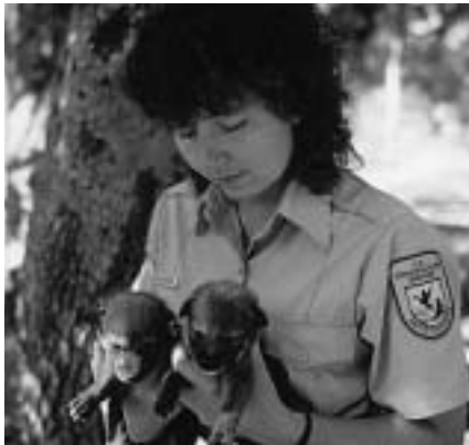
USFWS employee with red wolf pups.

Retirement. The Federal Employees Retirement System is a flexible plan for a flexible work force. Almost all new Federal employees are automatically covered by this system. It includes a tax-deferred retirement savings and investment plan that offers the same type of savings and tax benefits that many private corporations offer their employees under 401(k) plans. Employees can invest up to 10 percent of their salary with the Government matching employee contributions up to 5 percent. Additionally, this plan offers Social Security benefits for retirees at least age 62 as well as disability and survivors benefits and a monthly payment depending on the employee's pay and length of service.