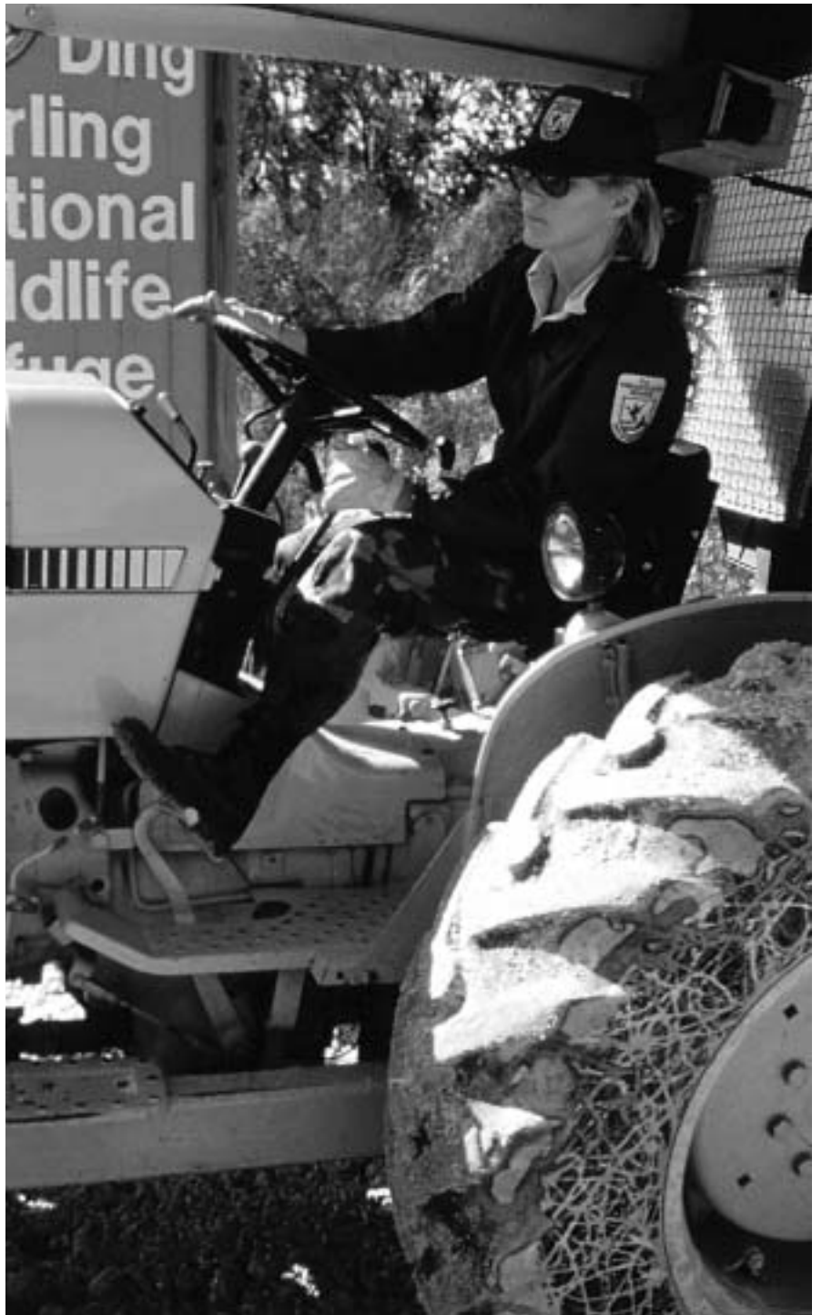
Work on a refuge, Ding Darling NWR.