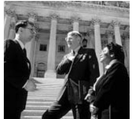
Congressional Operations Seminar: USFWS