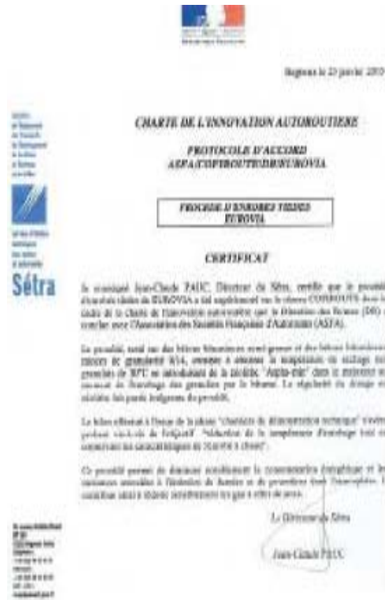
Figure 2. Aspha-min SETRA Certificate.

In France, new innovations for road authorities are evaluated by a partnership between the developer (often a contractor) and the road directorate. SETRA, Service of Technical Studies of the Roads and Expressways, represents the road directorate. Both partners have to fund the evaluation. The evaluation process starts with a laboratory evaluation; if successful, field trials are undertaken, and then guidance papers are prepared for use of the product. The final step is to incorporate the product into existing standards or develop new ones if no applicable standard exists. Trial sections are constructed along with a control section, each a minimum of 500 meters long. Trial sections are monitored for a minimum of three years. Typically, at least three trial sections are used to evaluate a single product, and a certificate is awarded at the end of a successful evaluation. The certificate technically validates the product and provides guidelines for the product's use. Certificates are often used by contractors for marketing. In 2007, Aspha-min zeolite was awarded a