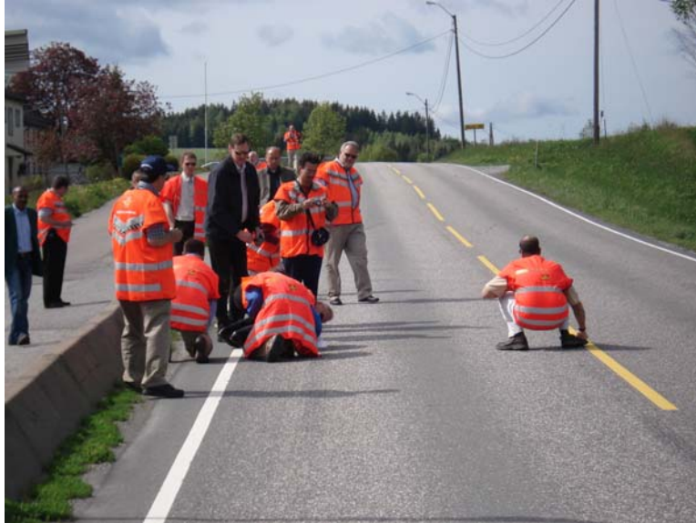
Figure 4. U.S. Scan Team Inspecting WAM-Foam Pavement in Norway

In Germany, laboratory and field performance data was presented on seven WMA test sections being monitored by BASt. In all cases, the test sections had the same or better performance than the HMA control sections (7, 15). In addition, several of the WMA additive suppliers presented performance data on a variety of trial sections, some of them on commercial projects. Again, the performance of the WMA was as good as or better than the HMA (or in some cases HMA that had previously been used at the site). Three of the WMA additives used in Germany, Fischer-Tropsch wax (Sasobit), Montan wax (Asphaltan-B), and fatty acid amides (Licomont BS 100 or Sübit) have the advantage of increasing the stiffness of the binders at high temperatures. The low temperatures in Germany are generally somewhat milder than the northern U.S. (PG xx-22 or warmer). Therefore there is less concern about low temperature cracking.