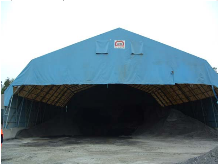
Figure 3. Kolo Veidekke's Covered RAP Storage.

In Norway, the composite moisture content of the aggregates going into Kolo Veidekke’s plant near Ås ranged from 2 to 3 percent. Further, they practiced good material management practices like covering their RAP pile (Figure 3) and their conveyors. In Germany, aggregates with low water absorptions, such as gneisses, granites, and quartzite are generally used. The aggregates used in HMA in every region of France have less than 1 percent water absorption. Lower water absorptions and composite moisture contents make it easier to dry the aggregates.