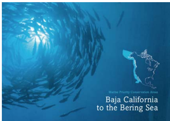
Marine Priority Conservation Areas: Baja California to the Bering Sea (2005)

The NAMPAN partnership has produced several technical products and conducted technical workshops and symposia, including: