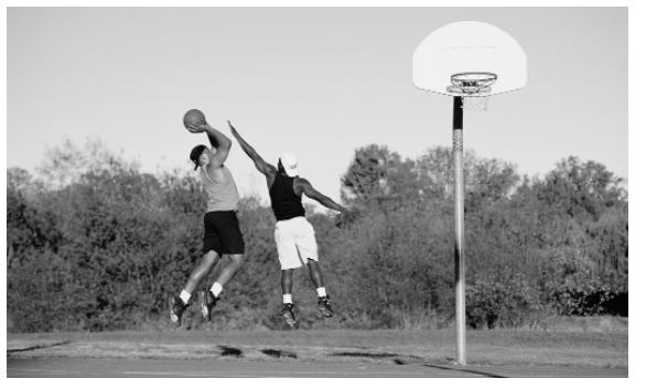
Children and adults of all ages who are active outdoors are at risk from ozone exposure.

In general, as concentrations of ground-level ozone increase, more and more people experience health effects, the effects become more serious, and more people are admitted to the hospital for respiratory problems. When ozone levels are very high, everyone should be concerned about ozone exposure.