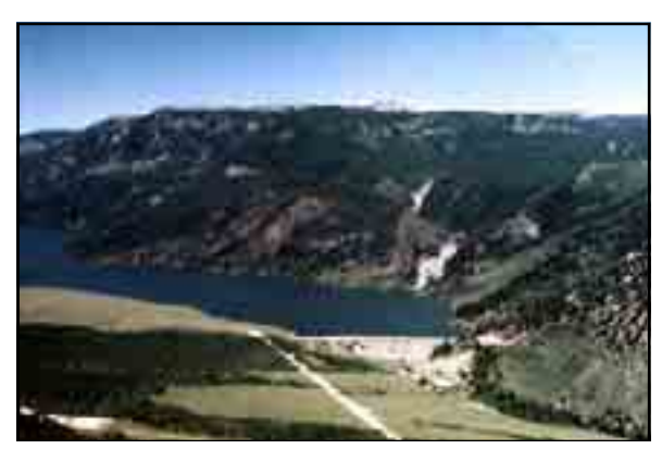
Moon Lake Dam and Reservoir.

High Mountain Lakes Stabilization. Stabilization of thirteen high mountain lakes will provide constant lake water levels year-round. Nine of these lakes (Bluebell, Drift, Five Point, Superior, Milk, Farmers, East Timothy, White Miller, and Deer) are located in the in the Upper Yellowstone River watershed and four (Brown Duck, Island, Kidney and Clements) are in the upper Lake Fork watershed. Consequently, streamflows originating in these upper watersheds will return to natural hydrologic runoff patterns, wilderness fishery and recreational values will be restored within the High Uintas, and operation and maintenance impacts will be eliminated in the wilderness area.