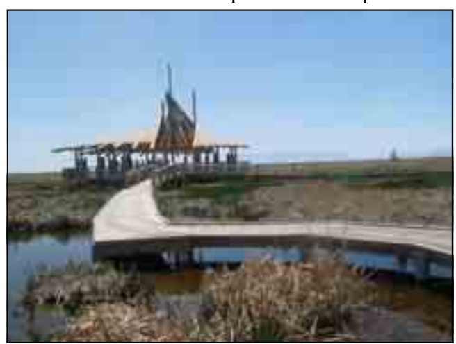
Great Salt Lake Shorelands Preserve Visitor Center

Implementation to Date & Future Actions The Commission is working with partners to acquire important wetland and upland habitats primarily around the eastern and southern shores of the Great Salt Lake. Since 1994, 1,844 acres have been acquired in these areas with Commission funds. The purchases complement other area acquisitions, some made by The