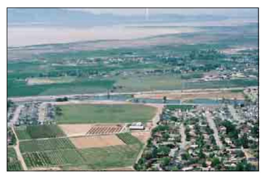
Utah Botanical Center and Wetland Education Ponds in Kaysville, with the Great Salt Lake in the background.

The Utah Botanical Center has also assumed responsibility for managing WEEP, now known as the Utah Wetlands Interpretive Network.