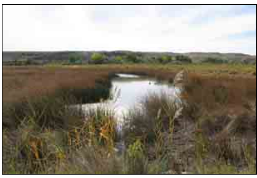
Lower Duchesne Wetlands

the earlier plan developed by the Bureau of Reclamation and Bureau of Indian Affairs, which the Ute Indian Tribe had never endorsed. Based on the feasibility study, the Commission, Department of the Interior and Tribe entered into an agreement in 1998 for the Tribe to conduct additional investigations and NEPA analysis, and to implement the mitigation project. NEPA scoping occurred in 2001 and the LDWP DEIS was released for public review and comment in November 2003.