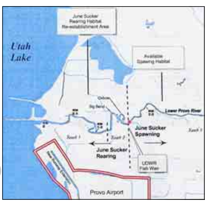
June sucker habitat re-establishment project area map showing study area reach designations.

The Commission intends to commit its funds and staff resources to the analysis, planning and implementation of potential projects to restore habitat in the lower Provo River in close coordination with the JSRIP over the next five years.