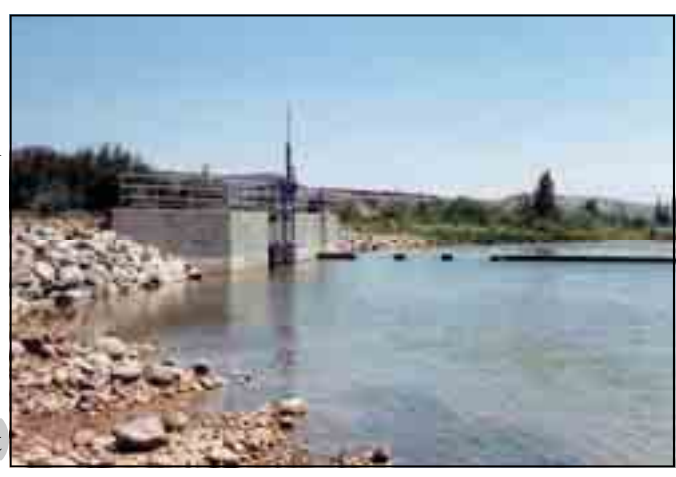
Rebuilt Pioneer Diversion on the lower Duchesne River

basis. Construction was completed on two projects located on the Duchesne River in 2001. A third, the Pioneer Diversion, was finished in 2002. A programmatic environmental assessment was completed in 2003. Four additional projects (two on the Duchesne River and two on the Strawberry River) were initiated in 2004. Construction of these four projects is scheduled for completion in 2005 and 2006. The Commission will attempt to identify additional sources of funds to complete remediation of the other diversion dams that were investigated for this project in 1998 and in the 2003 NEPA document.