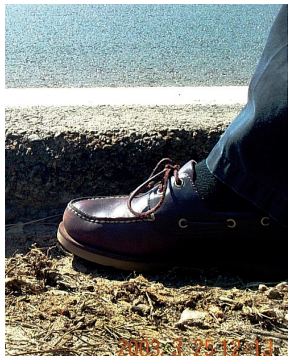
Sharp, steep pavement edge dropoffs can contribute to crashes.

A vehicle that has departed a paved surface can have difficulty re-entering the roadway if the pavement edge is vertical—especially if the edge