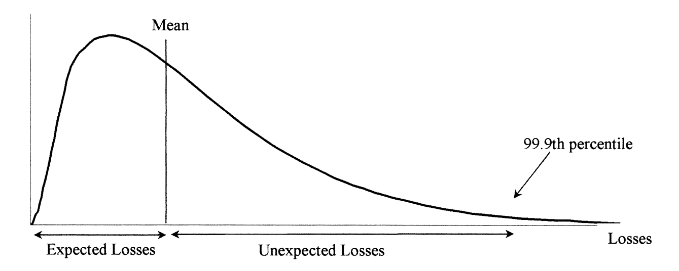
Figure 1 – Probability Distribution of Potential Losses

The framework's conceptual foundation is based on the view that risk can be quantified through the estimation of specific characteristics of the probability distribution of potential losses over a given time horizon. This approach assumes that a suitable estimate of that probability distribution, or at least of the specific characteristics to be measured, can be produced. Figure 1 illustrates some of the key concepts associated with the framework. The figure shows a probability distribution of potential losses associated with some time horizon (for example, one year). It could reflect, for example, credit losses, operational losses, or other types of