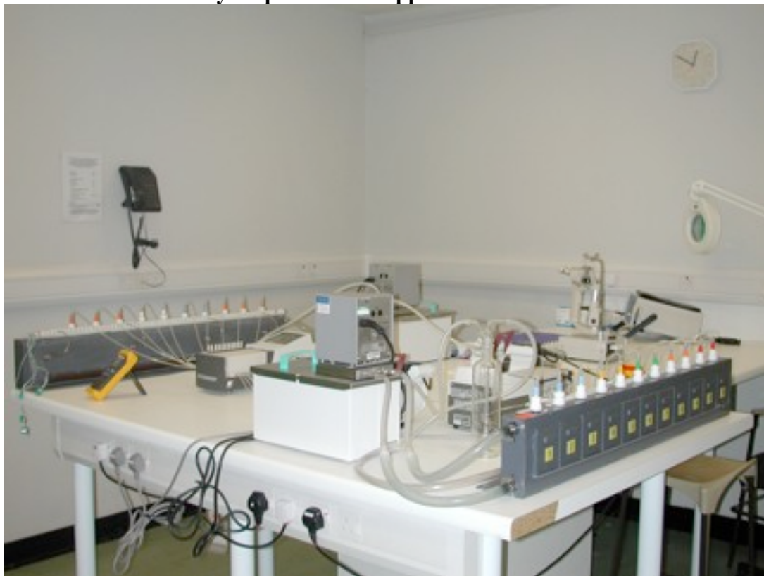
Figure F-1 Isolated Rabbit Eye Equilibration Apparatus