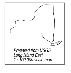
Figure 1. Brookhaven National Laboratory, Upton, New York.

Three hydraulically connected aquifer units make up a single zone of saturation located between 14 and 460 meters below the surface at the BNL site. This unconfined, composite aquifer is the primary drinking water source for Nassau and Suffolk counties, and has been designated by EPA as a solesource aquifer. The groundwater from the BNL site generally