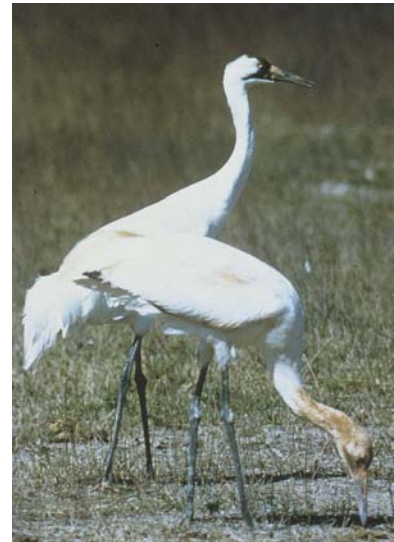
Whooping cranes.

the placement and operation of wind energy developments in places particularly important to migratory birds and national wildlife refuges, and to provide the science-based tools for the team to use.