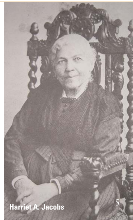
Harriet A. Jacobs

Later, Jacobs taught literacy to former slaves in the Freedmen's schools during Reconstruction following the Civil War: