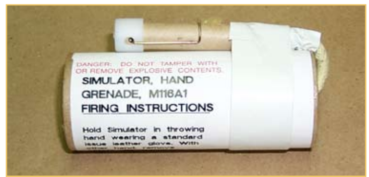
The M116A1 (shown) is a 4" tall cylinder - roughly the size of a deck of cards.

To date, EPA has detected perchlorate in groundwater in at least 34 states. Several states have been proactive in regulating perchlorate by developing a maximum contaminant level (MCL). The MCL for California is 6 ppb and the MCL for Massachusetts is 2 ppb. These regulations are much lower than the recommended federal guidance of 24.5 ppb and could impact the use of perchlorate-containing munitions in these states. Although current federal regulations do not exist today, perchlorate may be regulated under the federal Clean Water Act in the future. The Office of the Secretary of Defense Emerging Contaminant Directorate placed perchlorate on the Action List because continued use of perchlorate has significant potential impacts to human health and the environment as well as the DoD mission.