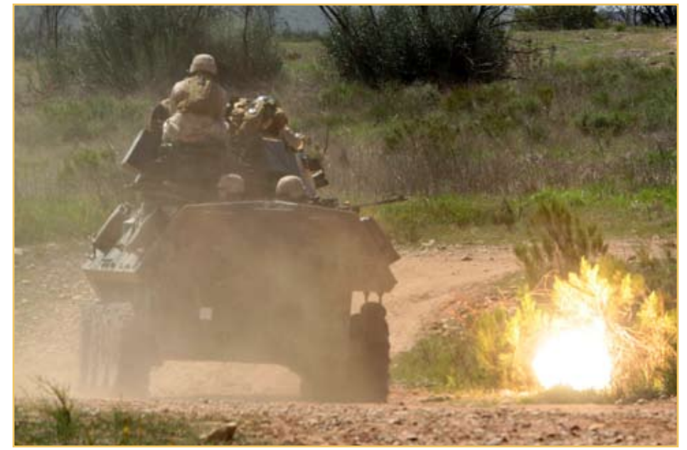
M116A1 used to simulate IED attack.

The manufacturer (Pyrotechnique by Grucci) played an integral role in assessing feasibility and producibility of the candidate materials. Grucci was involved from the start of the program and provided input into material development. The Grucci manufacturing facilities at Radford Army Ammunition Plant produced all limited scale production runs used in the testing and demonstration of the perchlorate-free simulators. In addition, Grucci hosted several IPRs, production plant tours and functional tests at their facility.