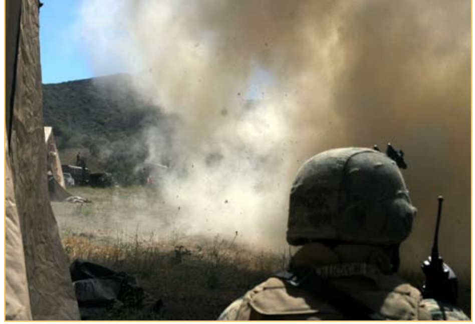
Simulators create battlefield conditions during training.

The new simulators formulation was approved and implemented through an Engineering Change Proposal (ECP) in April of 2007 to modify the Technical Data Package for the training simulators. This modification requires that the M115A2 and M116A1 training