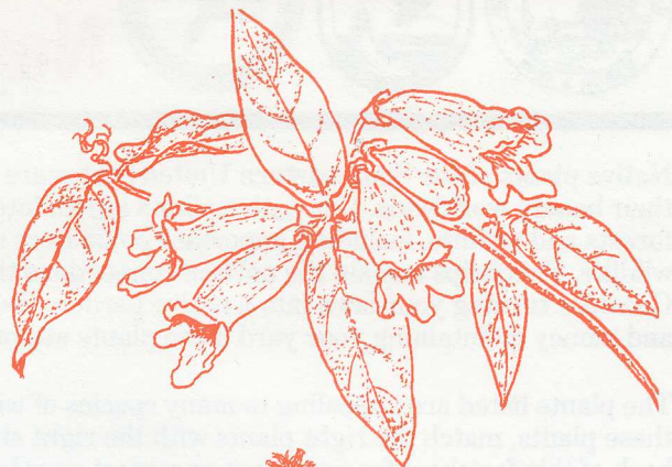
Crossvine