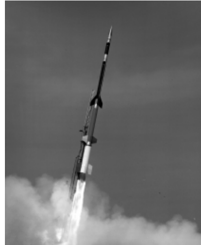
A Black Brant XII sounding rocket takes flight from Wallops Island. The four-stage rocket can fly to altitudes higher than 800 miles.

For those who do agree that exploration is important, the second point (clear goals) is no less essential. Steve Squyres, the Mars Exploration Rover principal investigator, addressed this subject: "We had a set of level-one requirements. They were negotiated with NASA Headquarters. They fit on a single piece of paper—two sides. They stated succinctly and clearly what the MER mission was expected to do . . . We would not have made it had we not all had a clear, unambiguous, common understanding of what it was we were trying to accomplish. Those level-one requirements were our guide star." Squyres spoke of the