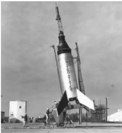
Crews prepare a Little Joe rocket for launch from Wallops Island. The Little Joe project tested escape systems for the Mercury capsule and biomedical conditions during rocket flight in the early 1960s.

With the establishment of NASA in 1958, Wallops' role in the new space agency changed and it was renamed Wallops Station. The station expanded in 1959 to include the Chincoteague Naval Air Station, which now is known as the Wallops Main Base.