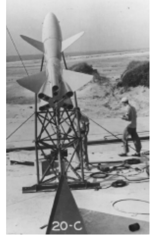
The first research rocket launched from Wallops Island was Tiamat on 4 July 1945.

After being established at Wallops, the focus of the Pilotless Aircraft Research Station was expanded to include studying airplane designs at supersonic flight and gathering information on flight at hypersonic speeds. These tests included aircraft and missile designs from a variety of organizations and corporations including Douglas, McDonnell, Boeing, North American, Lockheed, and Grumman.