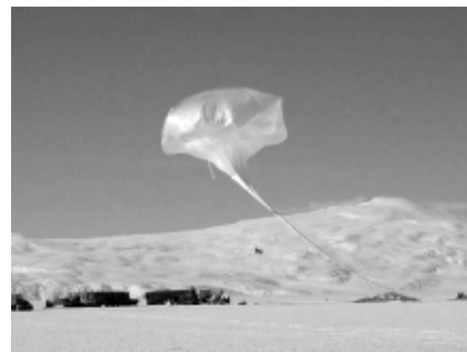
A NASA scientific balloon is launched in McMurdo, Antarctica. About 25 scientific balloons are flown annually from sites around the world.

In 1981, Wallops became a part of the NASA Goddard Space Flight Center and was renamed the Wallops Flight Facility. This change brought additional mission responsibilities, including the management of the scientific balloon program.