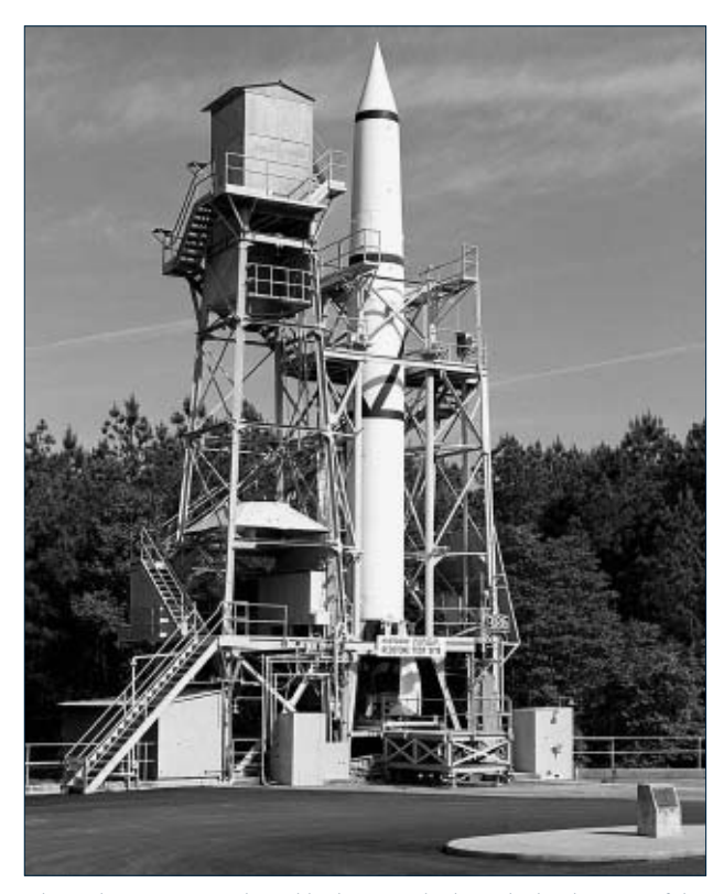
The Redstone Test Stand, used in the 1950s in the early development of the Redstone missile propulsion system, static tested the Redstone missile that launched Alan Shepard into space.