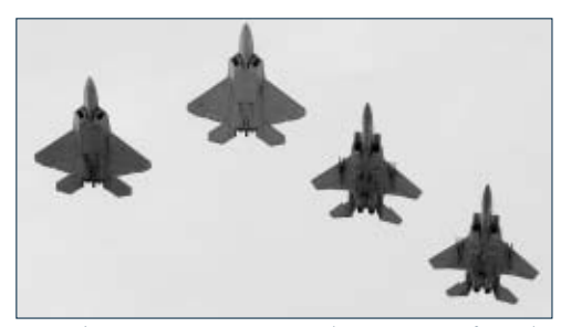
Two Air Force F-22A Raptors and two F-15s performed a flyover at the unveiling ceremony.

"Over there!" someone yelled as all eyes excitedly turned toward the two F-22A Raptors and two F-15s flying overhead in commemoration of Langley Field in Hampton, Virginia.