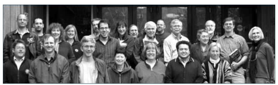
Participants of the NASA History Division and Dibner Institute seminar entitled "Cosmic Evolution and Astrobiology" gathered outside the Marine Biological Laboratory.

always-controversial question, "What is life?" All the while, the students kept the proceedings lively with a constant barrage of questions.